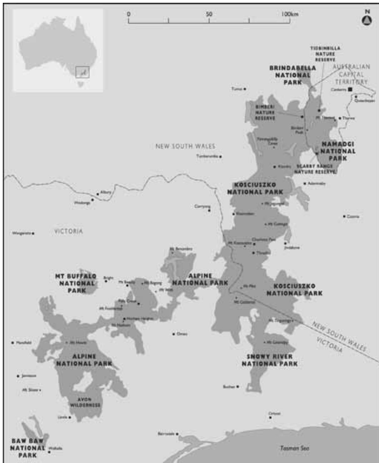
Map 1 Australian Alps national parks