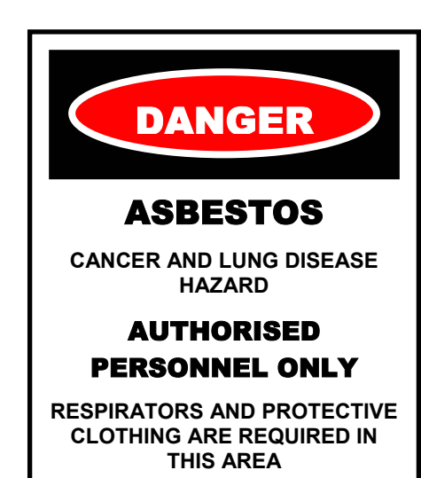
Figure 2 - Examples of warning signs and labels

Note : The examples of warning signs and labels in Figure 2 provide only an indication of the words that may be used to alert persons to the presence of ACM and asbestos hazards. The wording is not mandatory. Other warning signs and labels may be used, provided they meet the requirements of AS 1319.