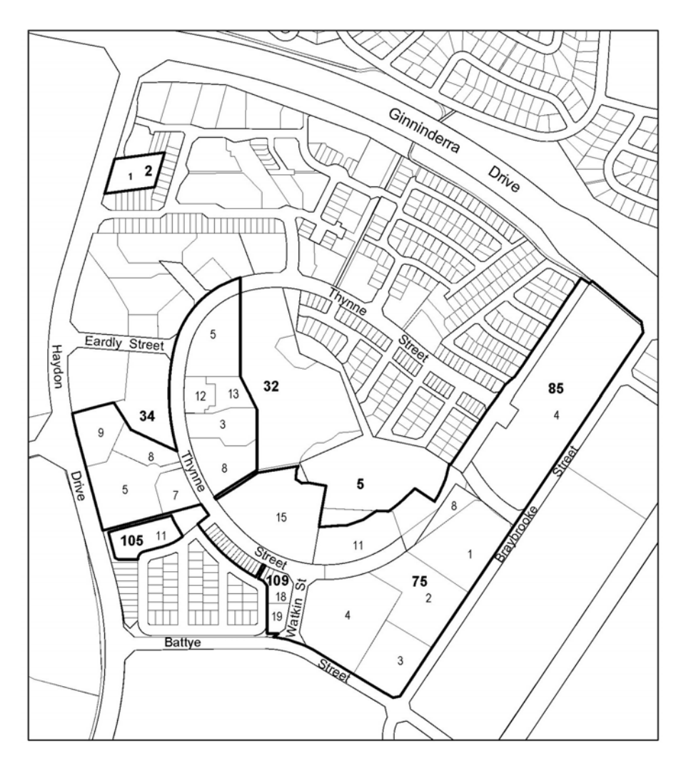
Figure B1 Bruce Mixed Use Area