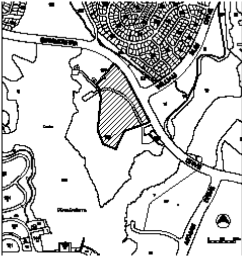
Figure 1 Belconnen