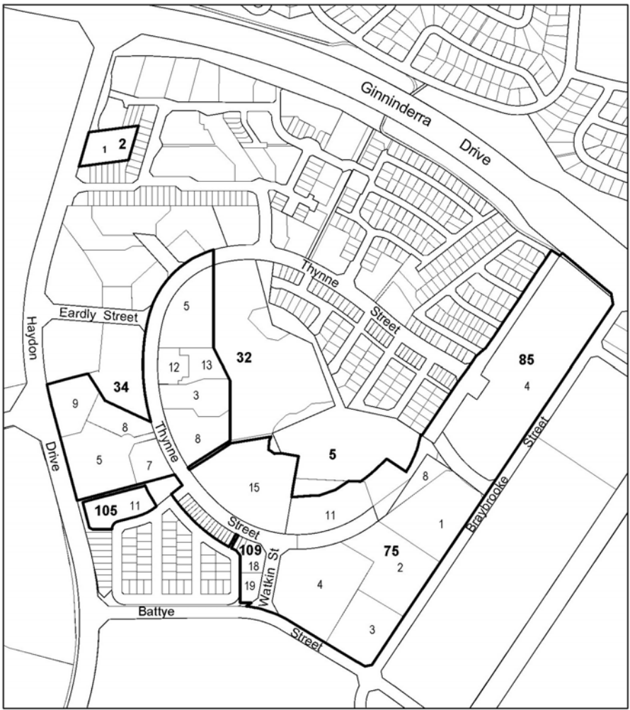
Figure B1 Bruce Mixed Use Area