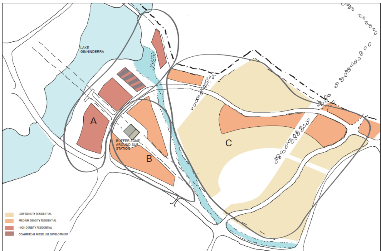
Figure 3: Development precincts