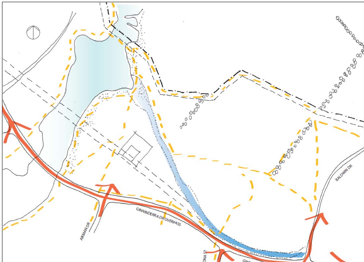
Figure 5: Movement network (red lines and arrows) and shared paths (dashed orange lines)