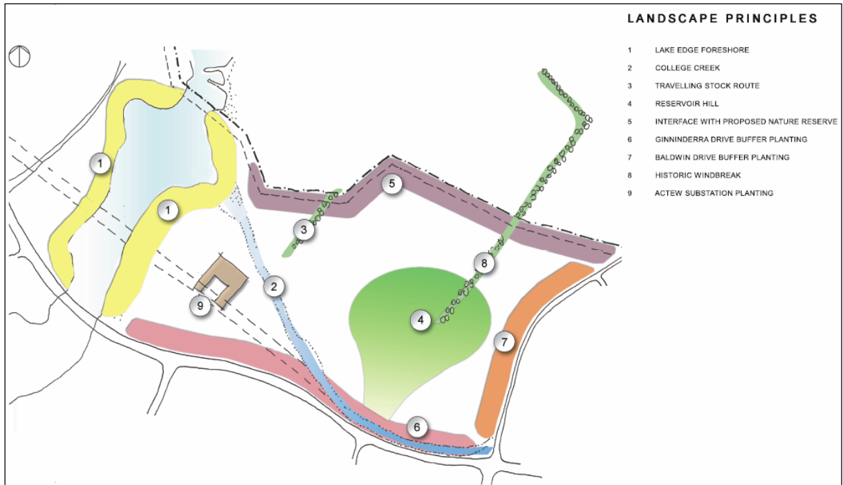
Figure 4: Landscape precincts