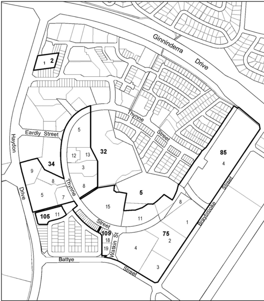
Figure B1 Bruce Mixed Use Area