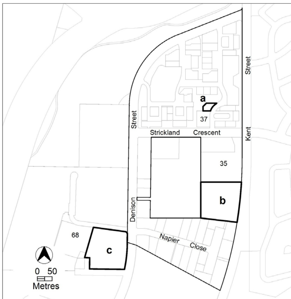
Figure 1 Deakin Office Site