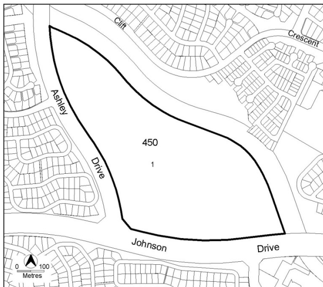
Figure 2 Richardson, Section 450 Block 1