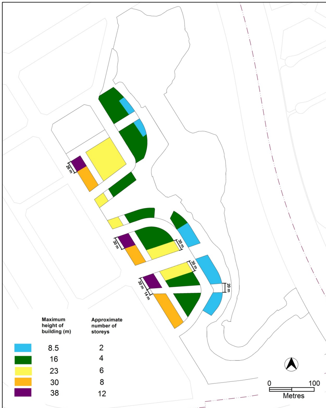
Figure 2 Building heights – Lakefront Development Area