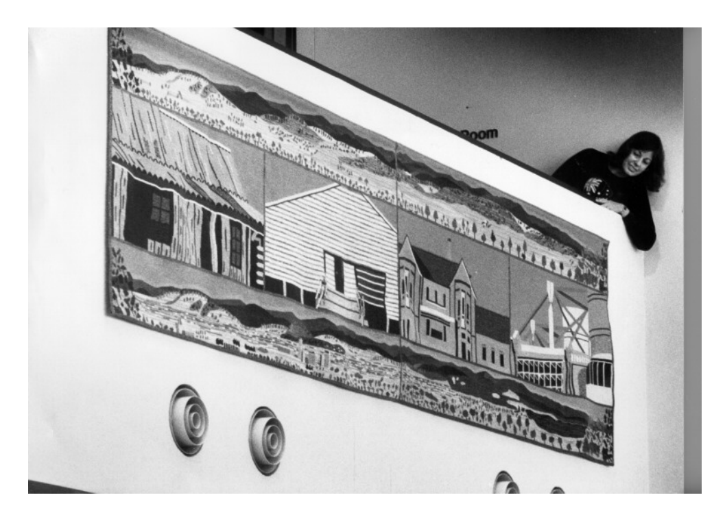
Figure 9. Woden Valley Tapestry by weaver Belinda Ransom (photograph by Michael Porter, 1984, Image No 000106, ACT Heritage Library, Picture Australia)