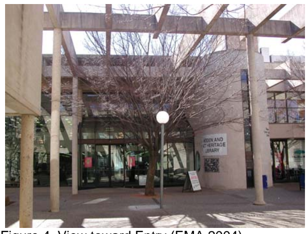
Figure 4. View toward Entry (EMA 2004)