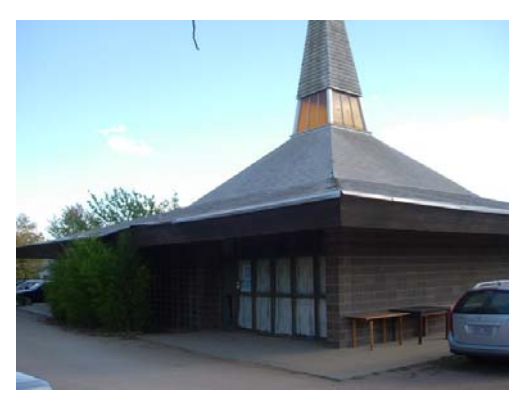
Figure 4. Holy Trinity Lutheran Church,