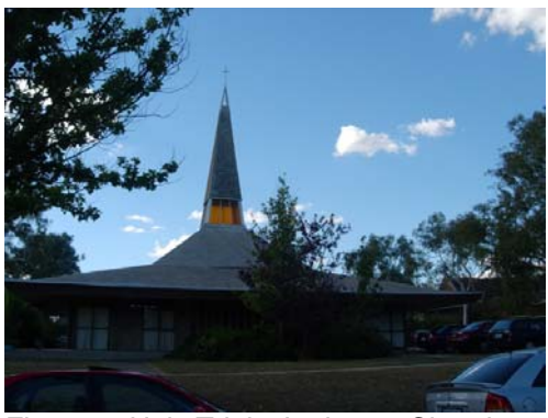
Figure 1. Holy Trinity Lutheran Church, S façade (Truscott 2008)