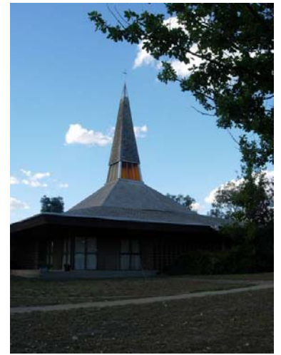
Figure 2. Holy Trinity Lutheran Church, S façade (Truscott 2008)