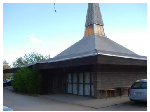
Figure 4. Holy Trinity Lutheran Church, NE corner (Truscott 2008)