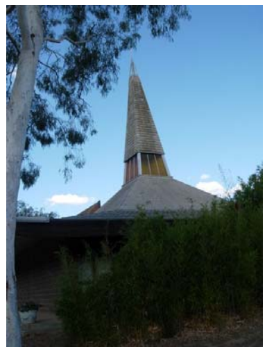
Figure 3. Holy Trinity Lutheran Church, W façade (Truscott 2008)