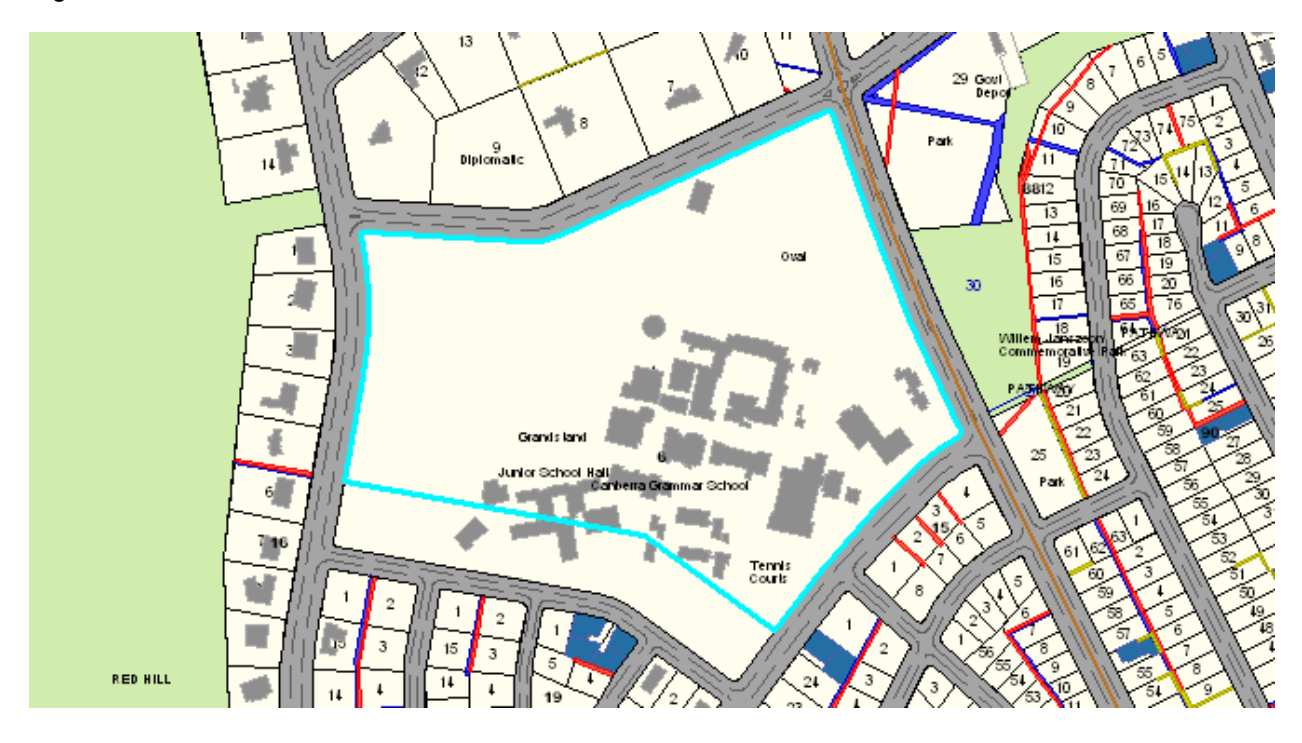
Figure 2: Plan of Canberra Grammar School