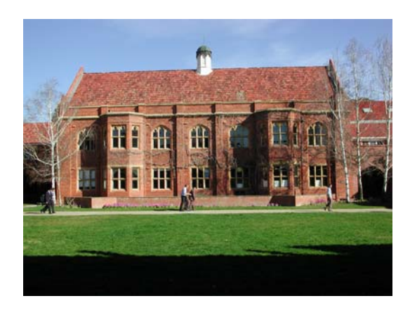
Figure 6: Former Dining Hall and Kitchen (1939)