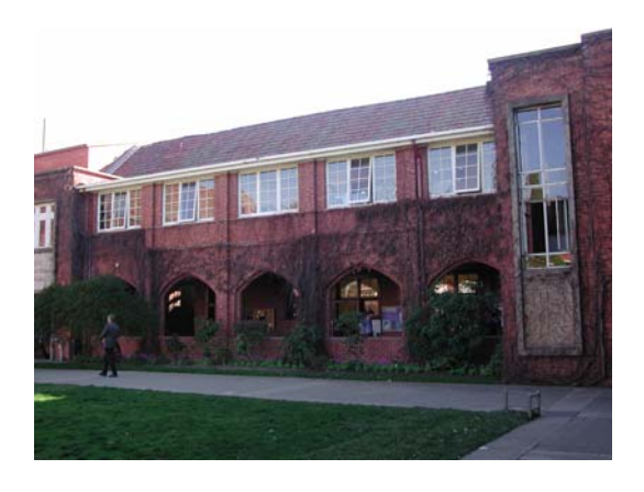
Figure 7: Garran House (1939)