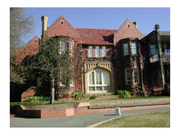
Figure 3: East Wing (1929)