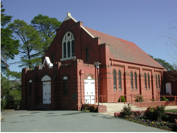
Figure 2. Church Entrance (1987)