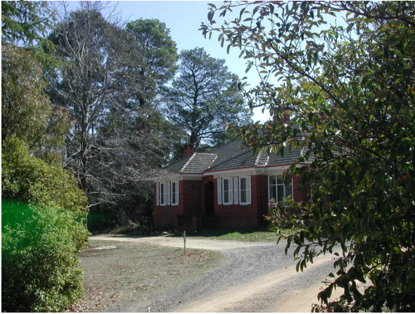
Figure 4. Church Manse – Front (1987)