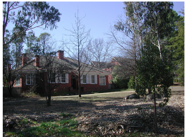
Figure 5. Church Manse – Rear (1987)