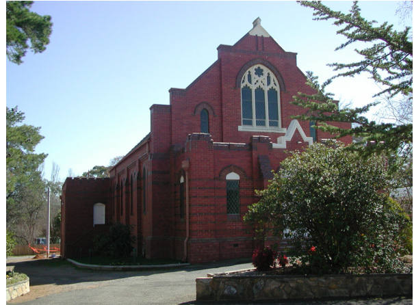
Figure 3. View of Church from Currie Cres (1987)