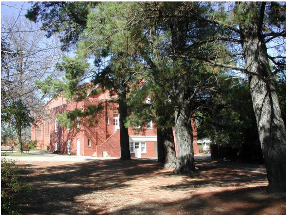
Figure 6. Rear of Church (1987)