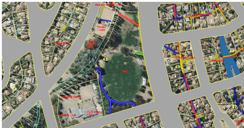
Aerial view of Blocks 17 and 13, Section 42, Griffith