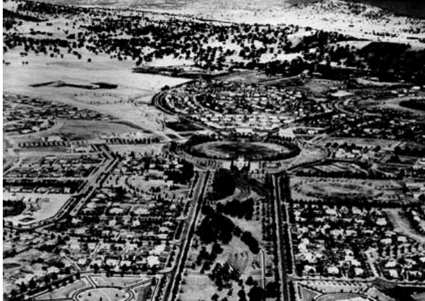
City - Canberra - Aerial view [photographic image]. 1 photographic negative: b&w, acetate 1946 NAA A1200, L6689A 7462597