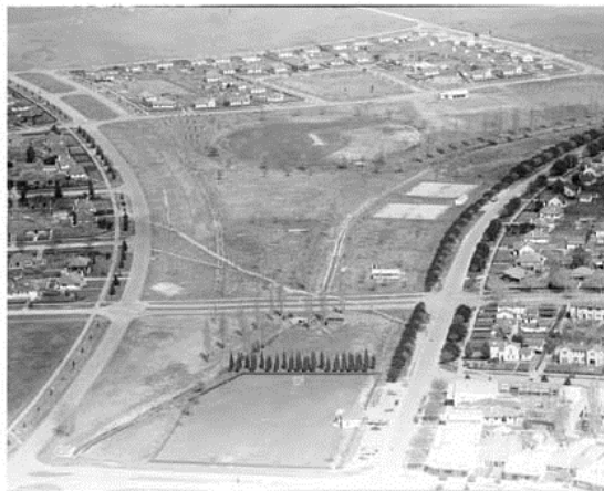
Cities and towns - Canberra - Flinders Way, Manuka, Canberra, 9.10.1950