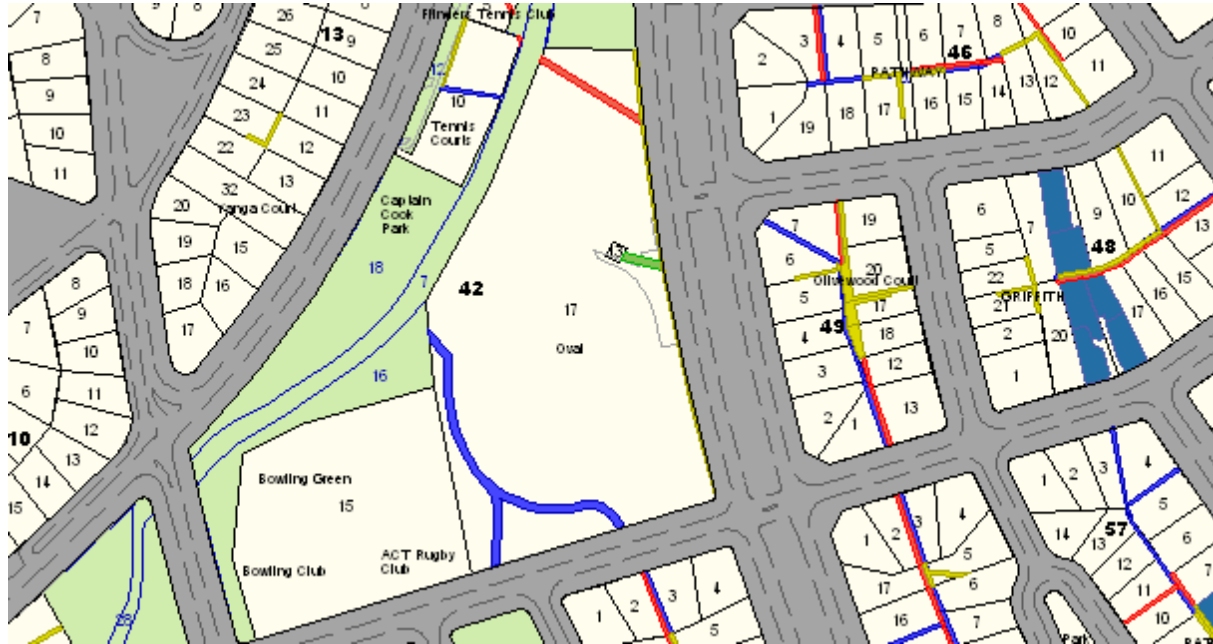
Boundary Map – Griffith Oval No. 1 is shown as Blocks 17 and 13, Section 42, Griffith.