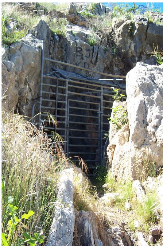
Entrance to main Cotter Cave