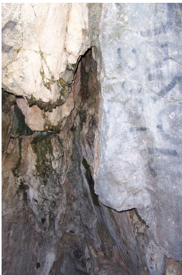
Main Cotter Cave