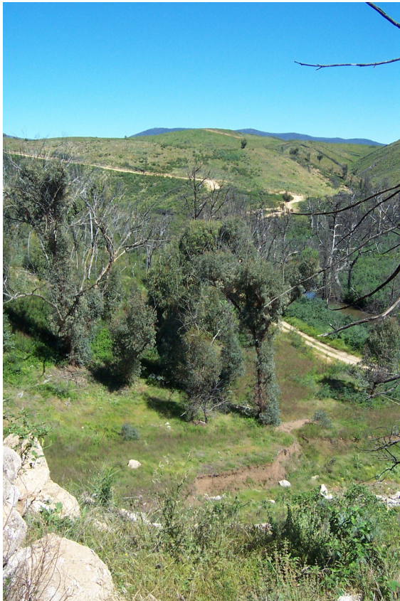
View north from main Cotter Cave.