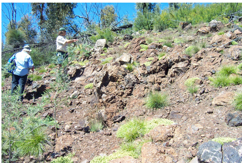
Site of upper population of Drabastrum alpestre .