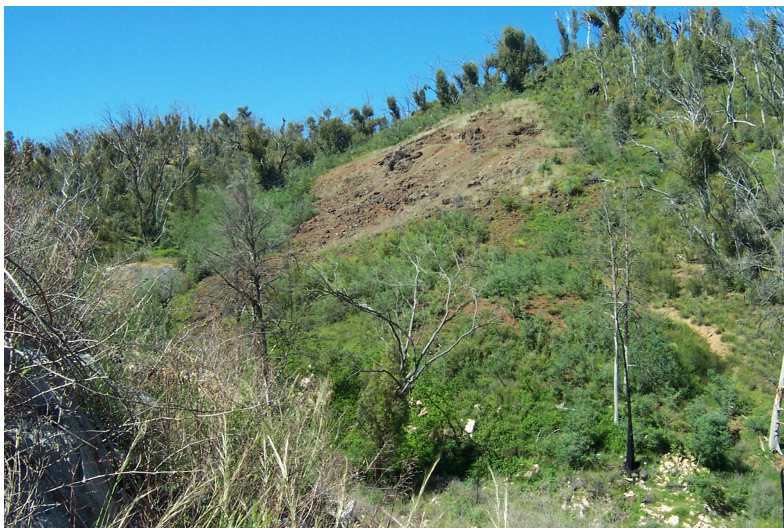
View south from main Cotter Cave showing the hill face that contains some of the mine shafts.