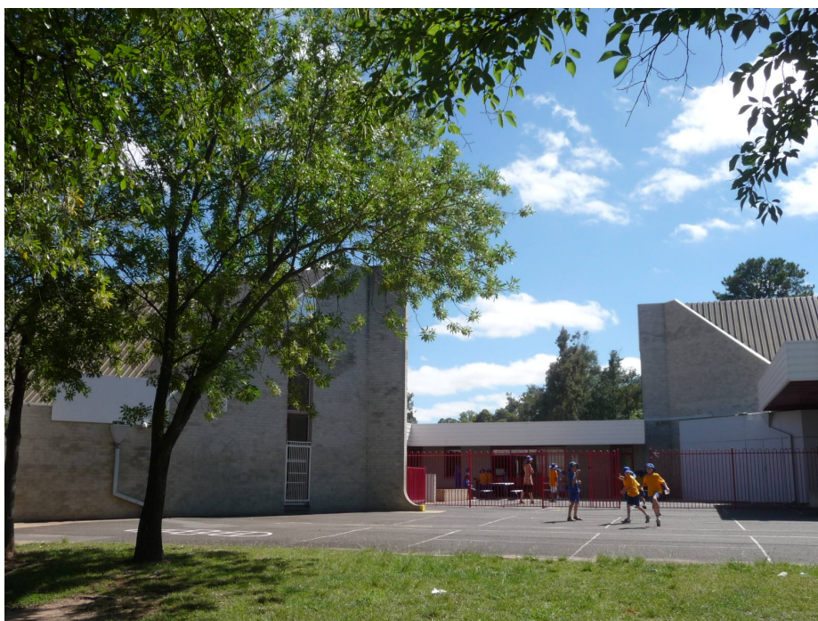
Giralang Primary School ,Giralang