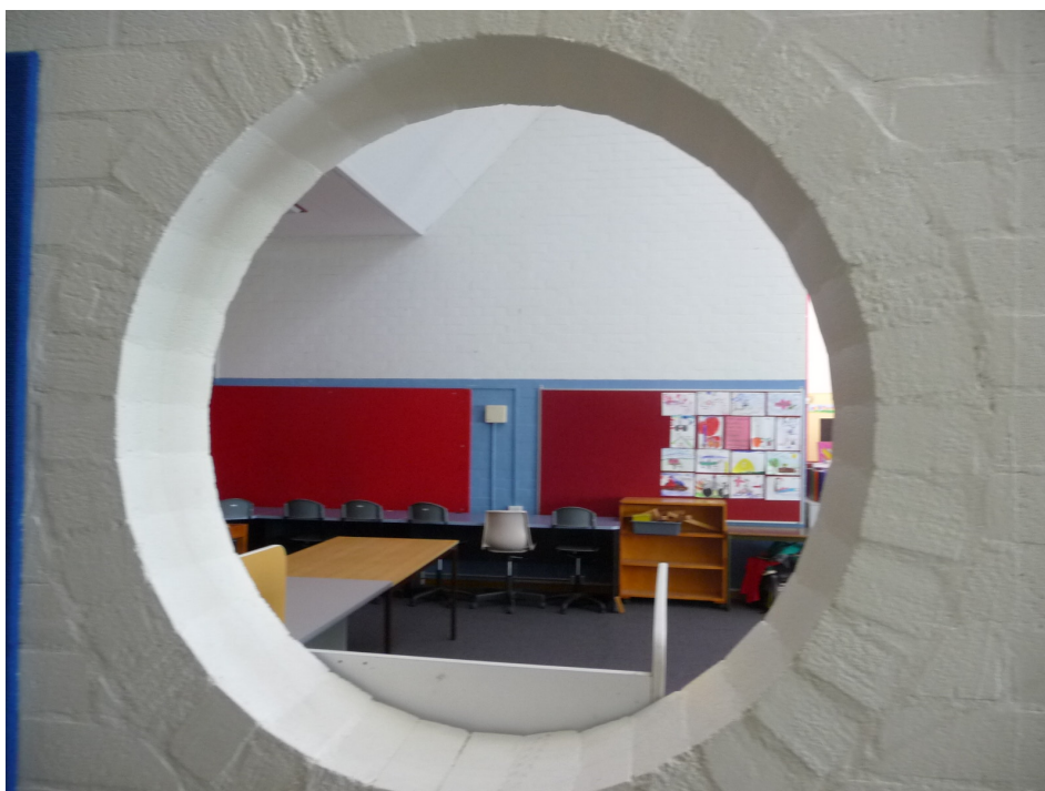
Giralang Primary School, interior of classroom