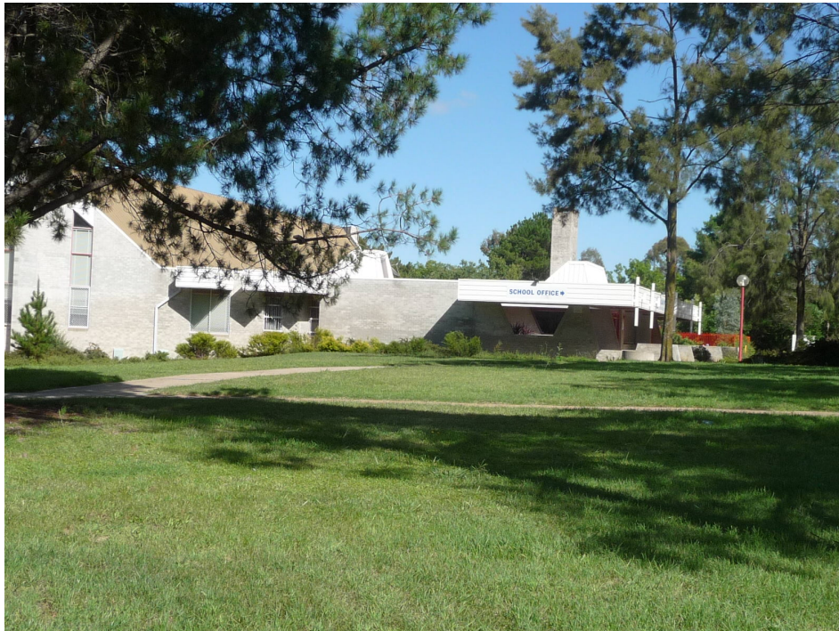
Giralang Primary School, Giralang