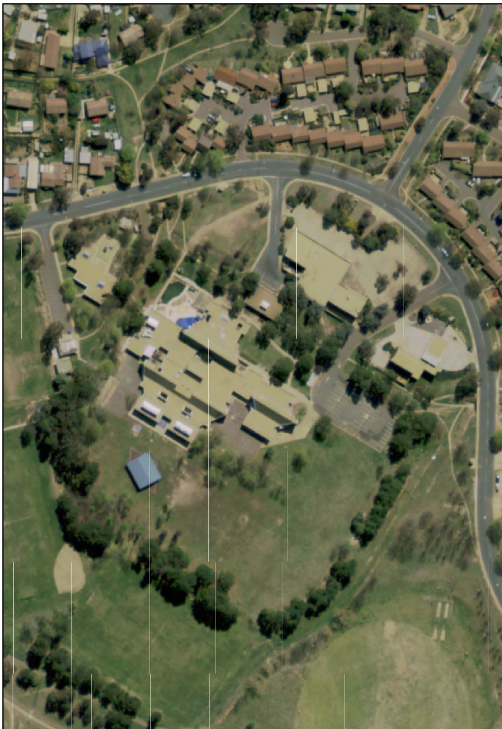
Giralang Primary School Complex showing extent of mature landscaping across the site.