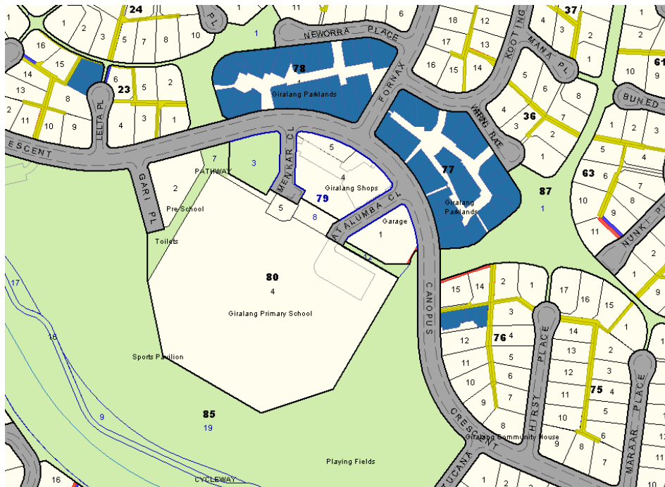
Giralang Primary School, Giralang