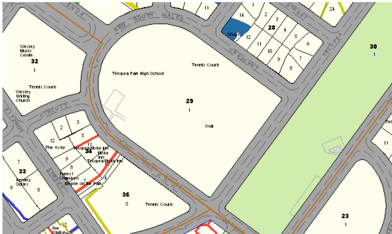
Block 1 Section 29, Barton, Canberra Central