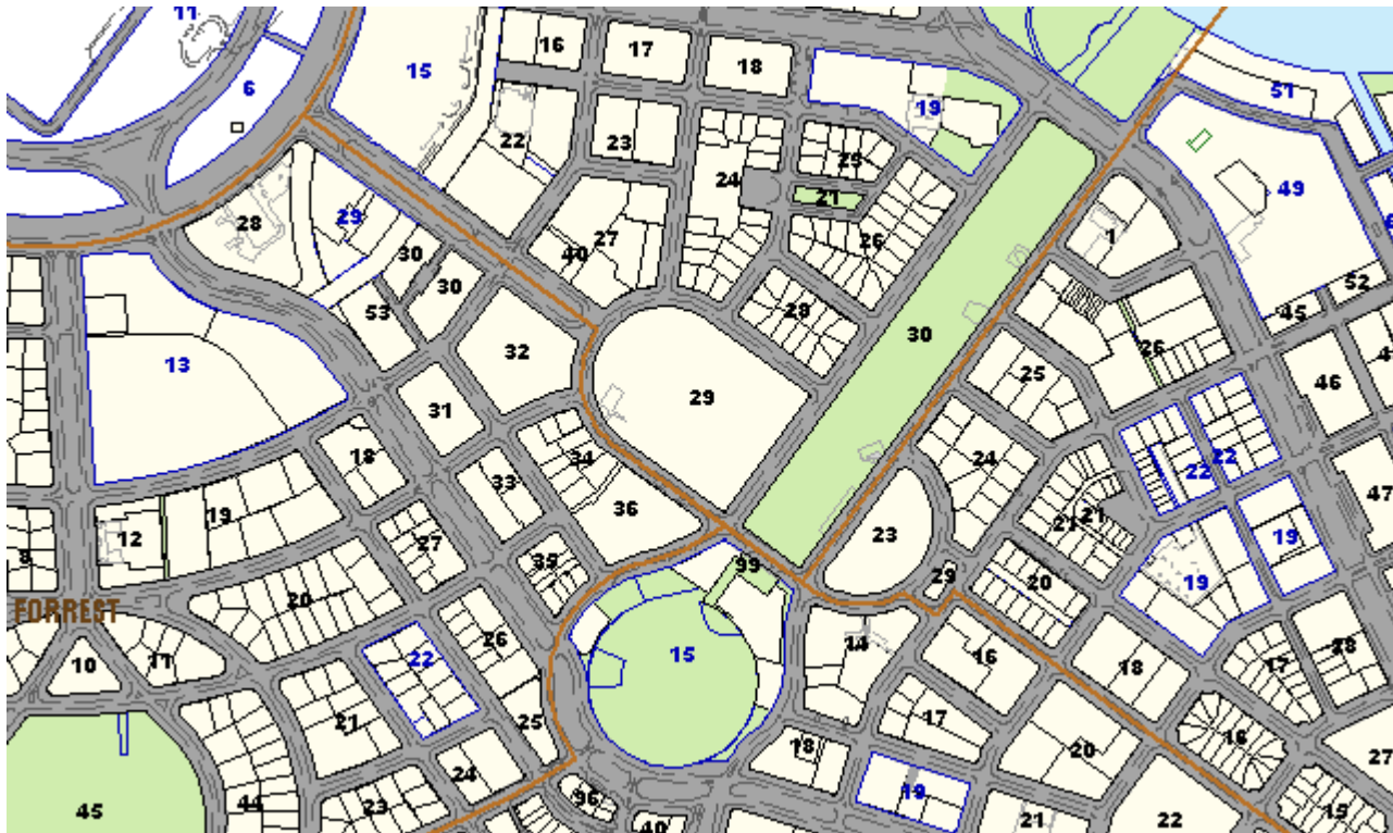
Block 1 Section 29, Barton, Canberra Central