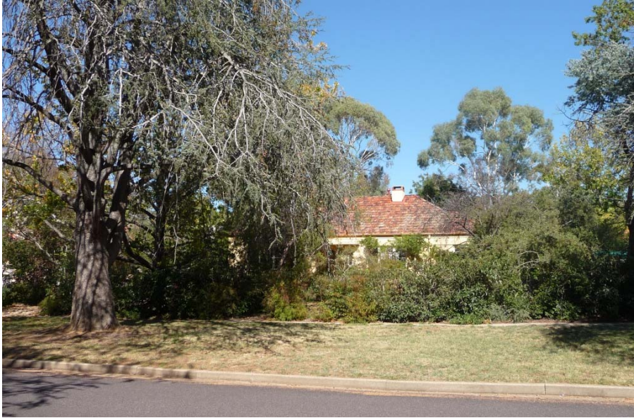
Figure 1. Street view of 70 Dominion Circuit, Deakin