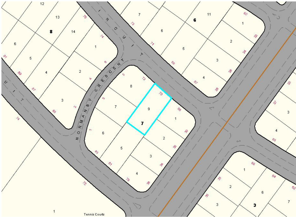
Figure 4. Location Plan of 70 Dominion Circuit Deakin