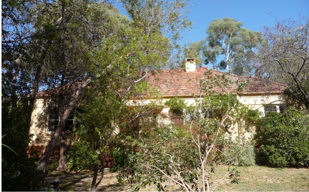
Figure 2. View of 70 Dominion Circuit, Deakin from property boundary