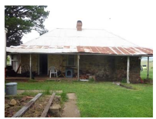
1850s stone cottage