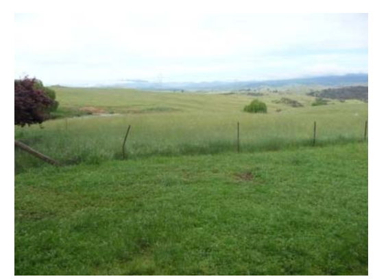
rural views over the Murrumbidgee River