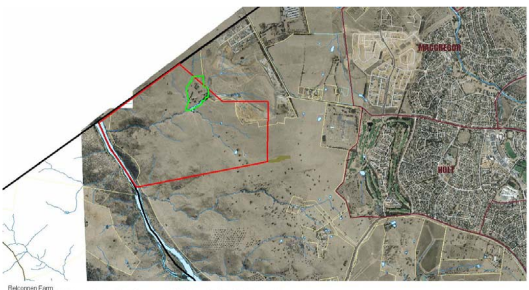
showing Soldier Settler boundaries overlaid with proposed ACT Heritage Register citation boundaries

Aerial image showing soldier settler boundary (solid red line), overlaid with citation boundary (solid green line).