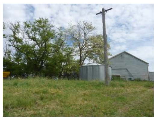
1930s woolshed exterior