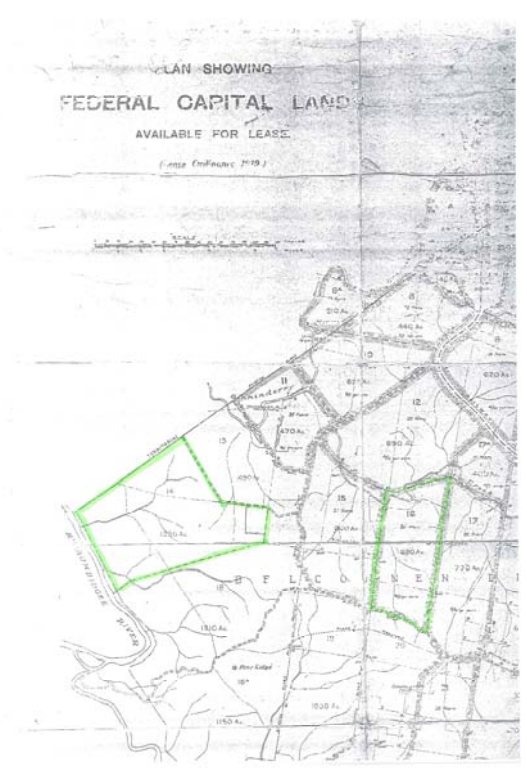
Figure 1: Plan Showing Federal Capital Land available for lease, 1919. Shepherd's leases are highlighted in green. National Library of Australia MAP G8984.C3G46 1920