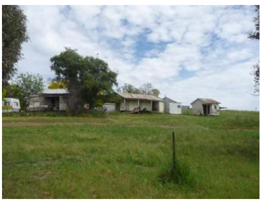
1920s/1930s shearer's quarters