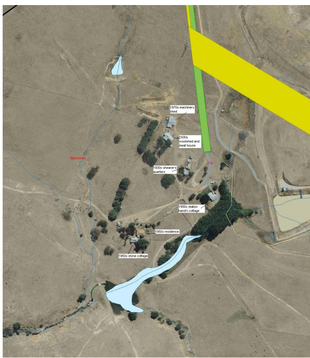
Aerial image showing creek lines and land title boundary.