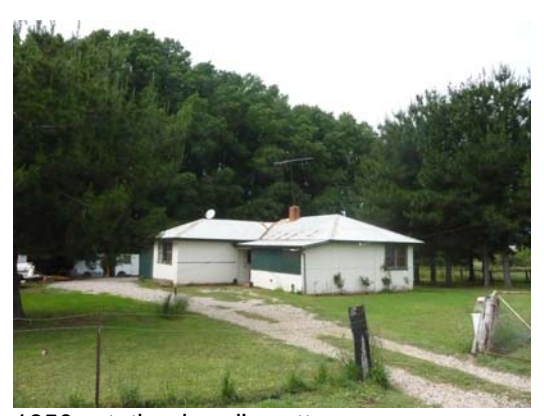
1950s station-hand's cottage