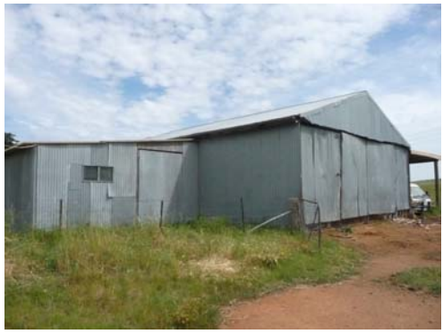
1970s machinery shed