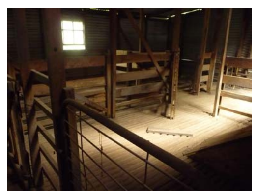
1930s woolshed interior