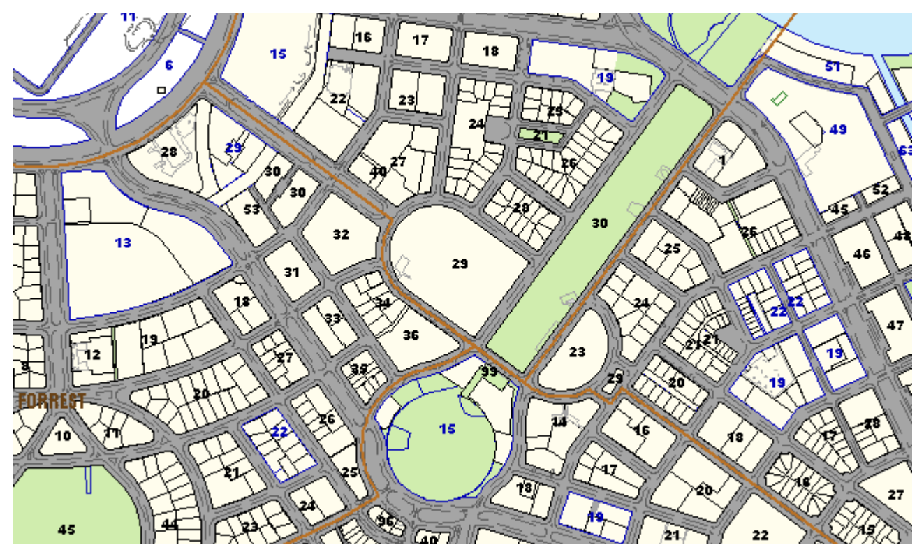
Block 1 Section 29, Barton, Canberra Central