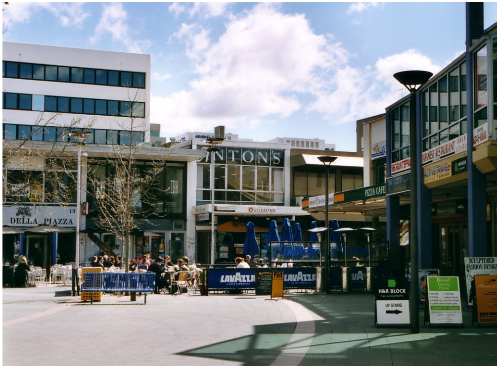
Garema Place outdoor cafés, Canberra