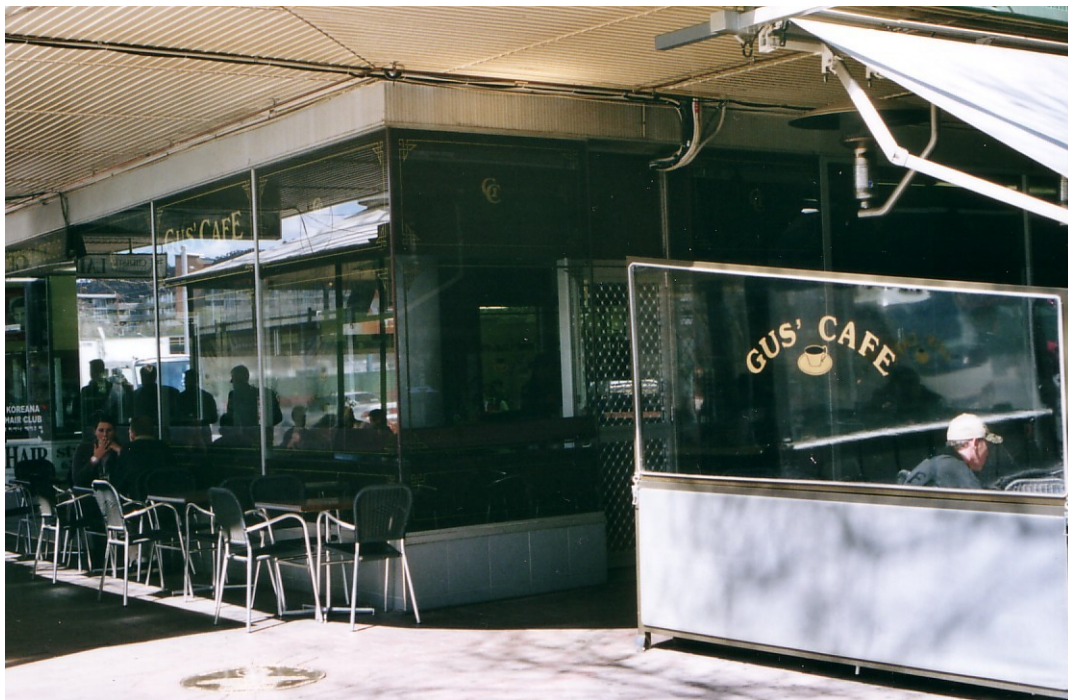
Gus' Café, Bunda Street, Canberra Photo – M. Park (2004)