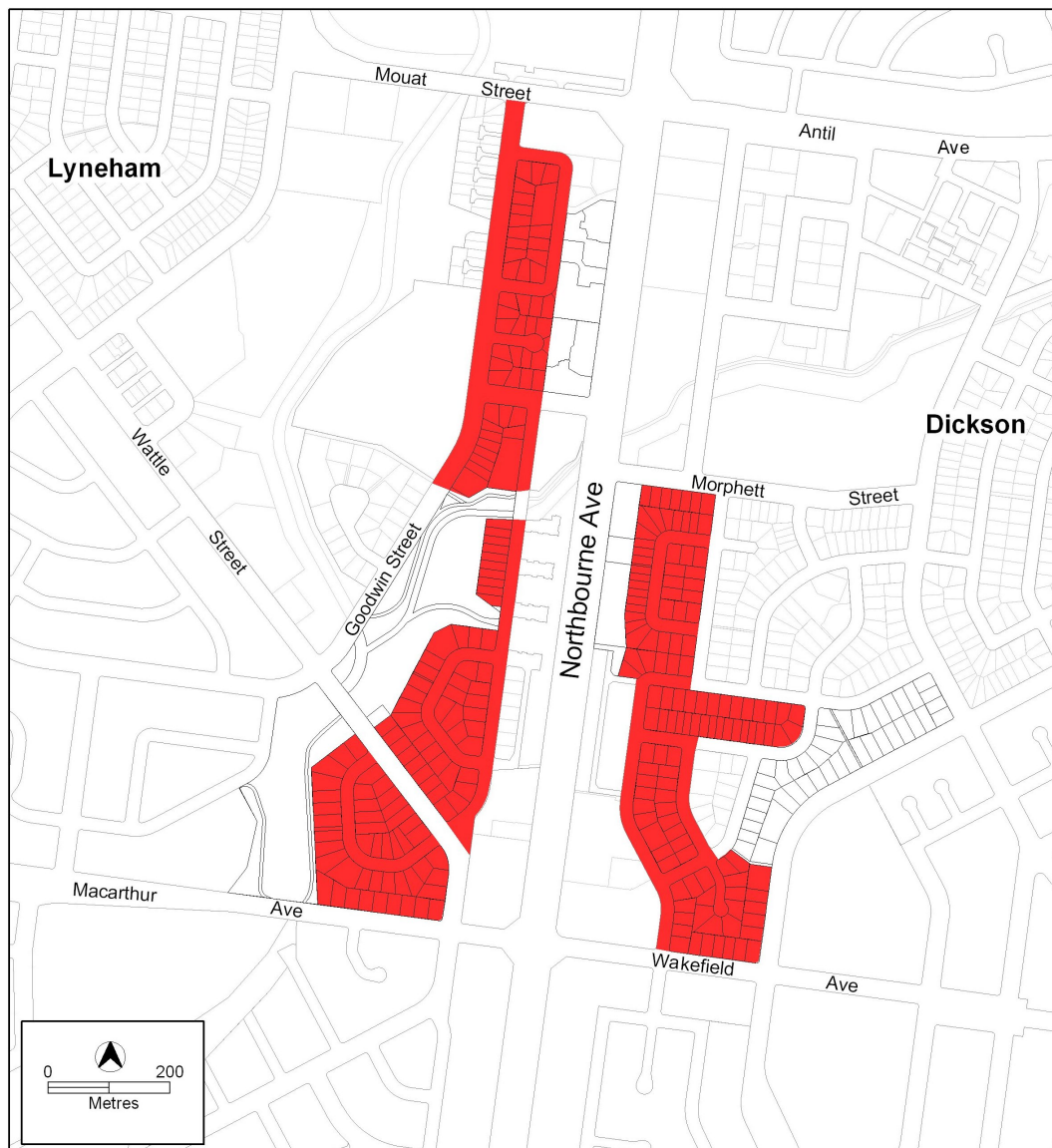
Map 1 – RZ4 zones north of Macarthur Avenue and Wakefield Avenue