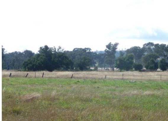
Mulligans Flat Ploughlands site – shown as long, dry grassy paddock, with exotic plantings