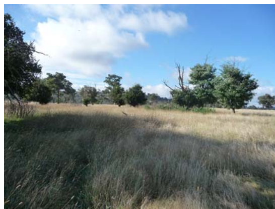
Mulligan's Flat Ploughlands