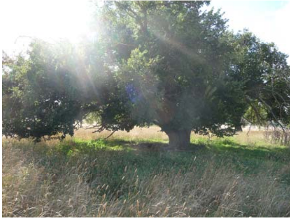
Mulligan's Flat Ploughlands, exotic plantings