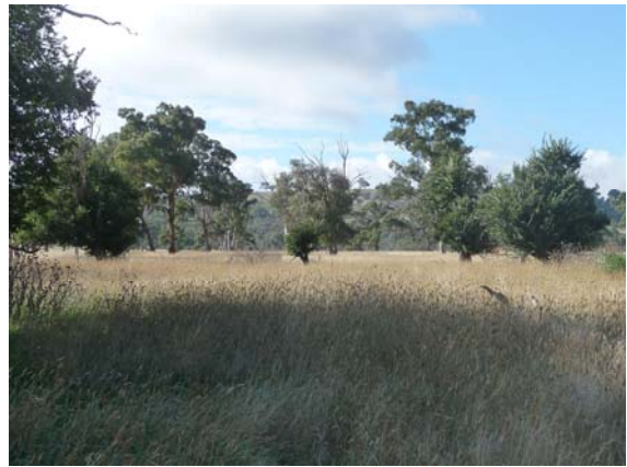
Mulligan's Flat Ploughlands