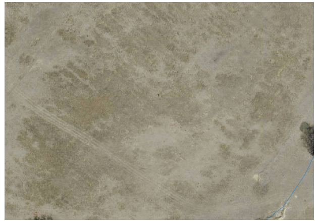
2009 aerial image of Well Station Ploughlands site

By way of comparison, aerial imagery from 2009 shows clear ridge and furrow lines still in existence at the Mulligan's Flat Ploughlands site.