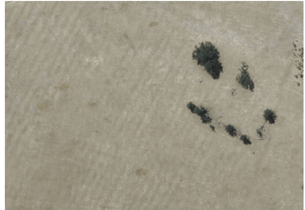
2009 aerial imagery of Mulligan's Flat Ploughlands site for comparison purposes