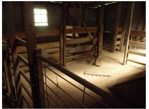
1930s woolshed interior