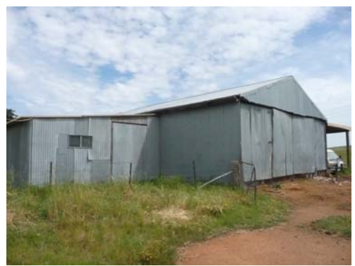
1970s machinery shed