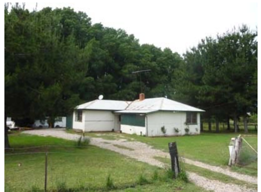
1950s station-hand's cottage