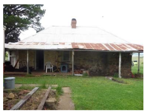
1850s stone cottage