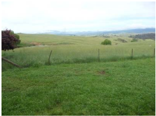
rural views over the Murrumbidgee River