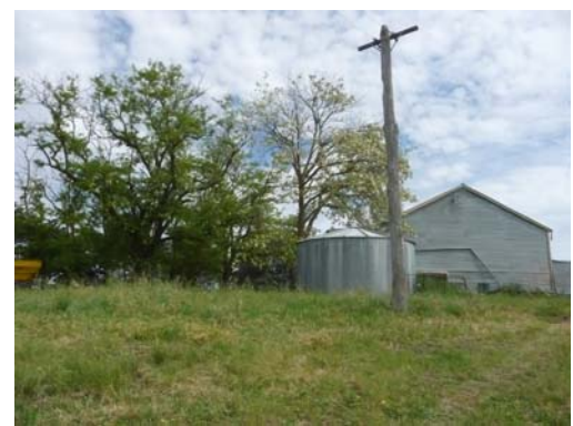
1930s woolshed exterior