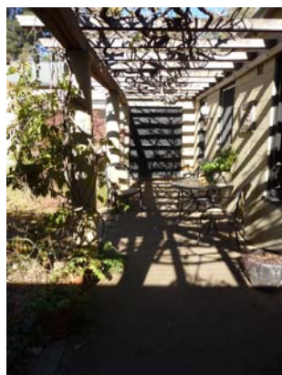
Formal entrance, off courtyard