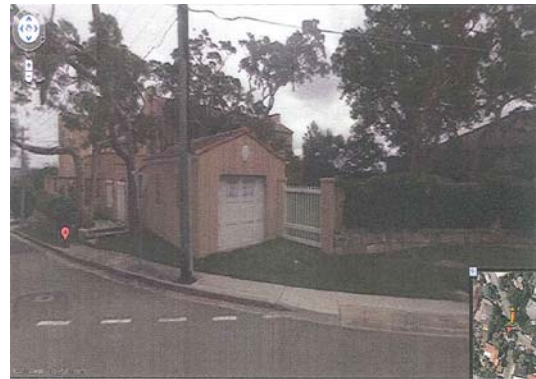
Greenway, 24 Wentworth Road, Vaucluse Google Street View