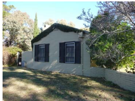
Residence, showing timber shutters and paned-windows