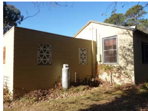
Eastern courtyard and laundry windows