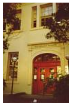
Old Geology Building, University of Sydney

NSW Heritage Office http://www.heritage.nsw.gov.au/07_subnav_04_1.cfm