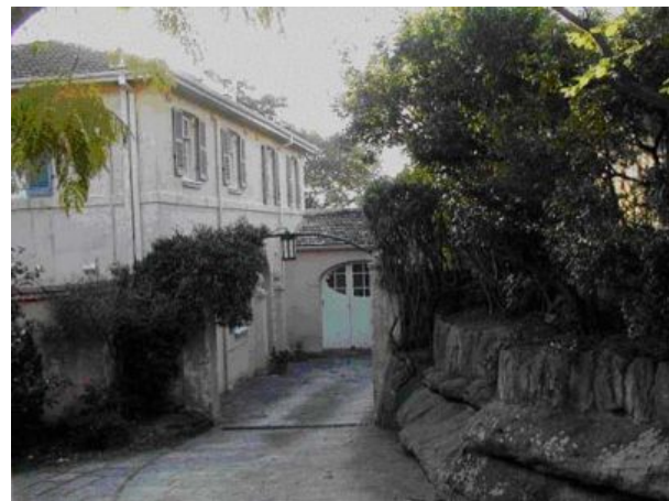
'Westray', 34 Wentworth Road, Vaucluse Westray, constructed in 1927, as the first private residence designed by Wilkinson. NSW Heritage Office http://www.heritage.nsw.gov.au/07_subnav_04_1.cfm