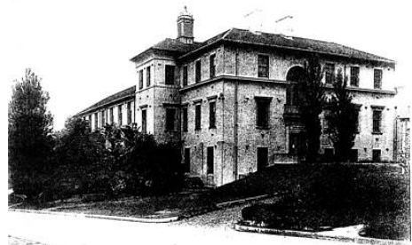
Zoology Building, university of Sydney

NSW Heritage Office http://www.heritage.nsw.gov.au/07_subnav_04_1.cfm