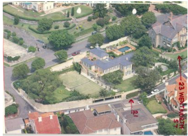
21 Wentworth Street, Point Piper, constructed between 1956-1959, as the second last of his residential designs.

NSW Heritage Office http://www.heritage.nsw.gov.au/07_subnav_04_1.cfm