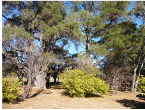
Arnold Grove and its setting of mature trees planted circa 1957.