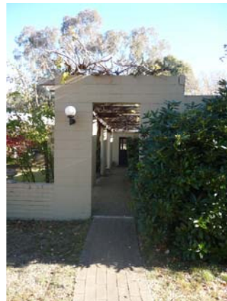
Pergola and loggia