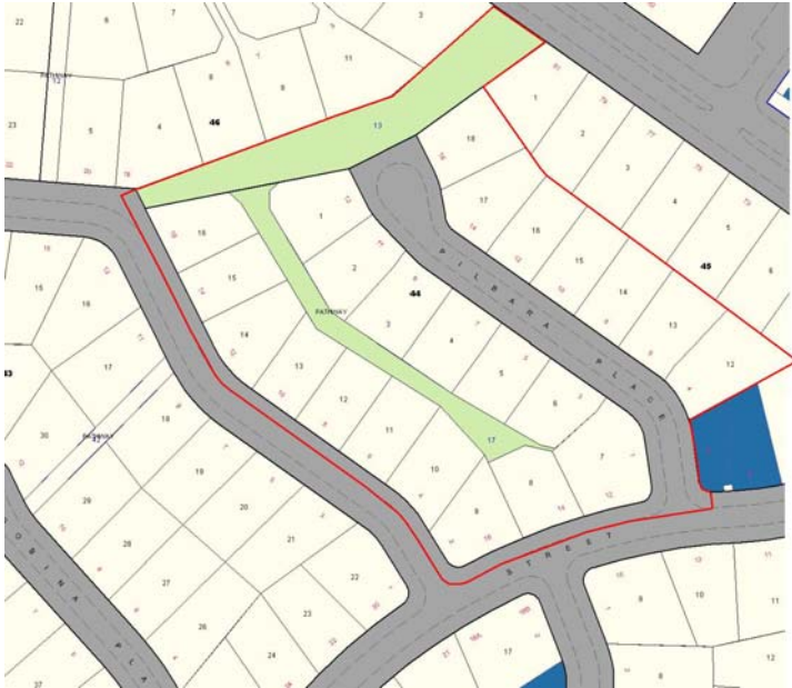
Fisher Housing Precinct boundaries indicated by solid red line