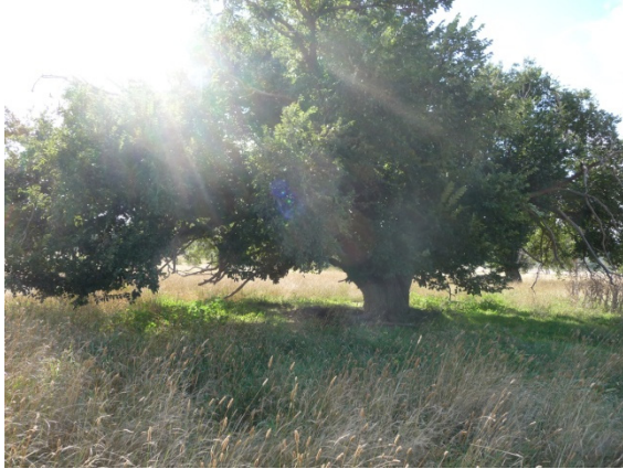
Mulligan's Flat Ploughlands, exotic plantings