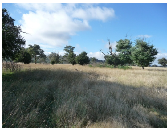
Mulligan's Flat Ploughlands