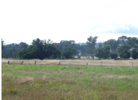
Mulligan's Flat Ploughlands site – shown as long, dry grassy paddock, with exotic plantings