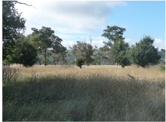
Mulligan's Flat Ploughlands