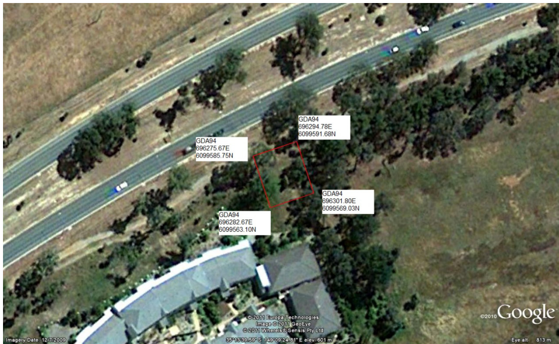
Place boundary identified by solid red line, indicating an area with a 10 metre boundary from the sign.