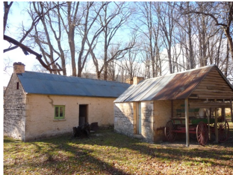
Blythburn cottage and kitchen at rear