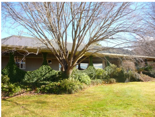
Booroomba Homestead – 17 June 2011