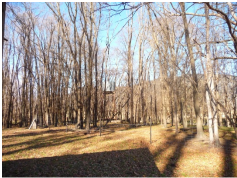
Blythburn water tank