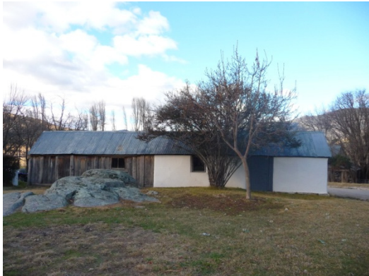
Slab building and blacksmith's