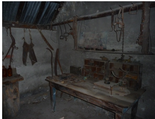
Blacksmith's - interior