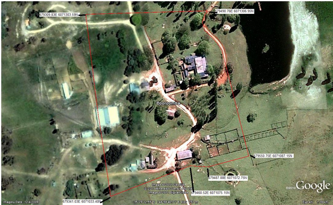
Boundary surrounding Booroomba outbuildings indicated by solid red line