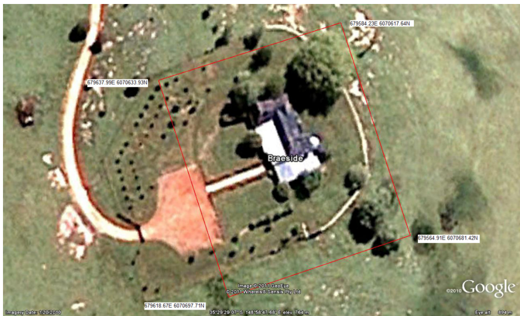
Boundary surrounding Braeside homestead indicated by solid red line