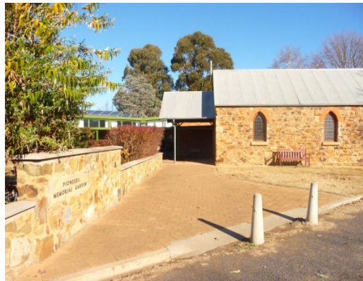
1942 Pioneer Memorial Garden