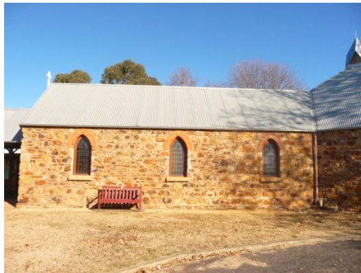
Original church building

The following images were taken on 24 June 2011