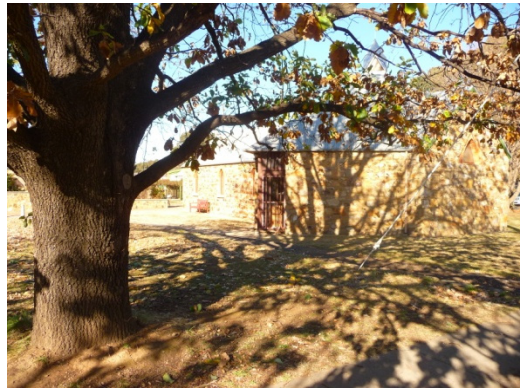
Elm tree and church