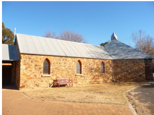
Original church building and 1978-79 extension