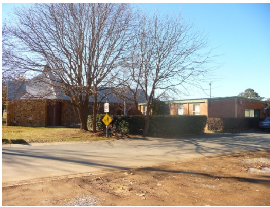
Original church and 1961 office