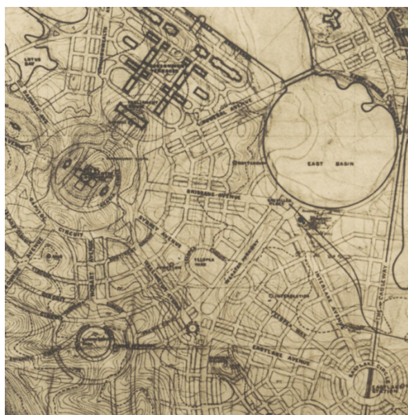
Detail of Walter Burley Griffin's final Plan of Canberra, 1918 'Canberra plan of city and environs. Walter Burley Griffin, Federal Capital Director of Design and Construction'

The Manuka and Telopea areas are named after features identified on Walter Burley Griffin's original plan for Canberra—Manuka Circle and Telopea Park (now the site of the Telopea Park School).