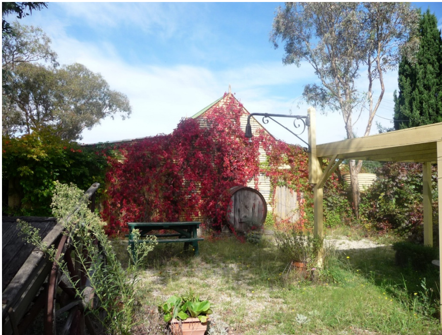
Fig 1: Garage c. 1920

Hill Station, boundary indicated by yellow line. Map is not to scale.