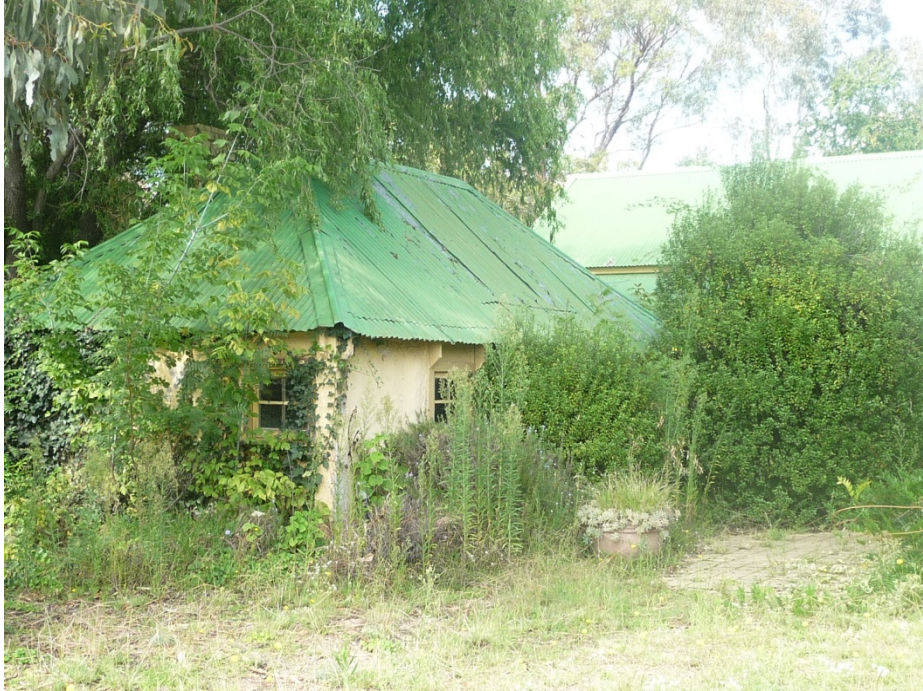
Fig 2: 1860s slab cottage