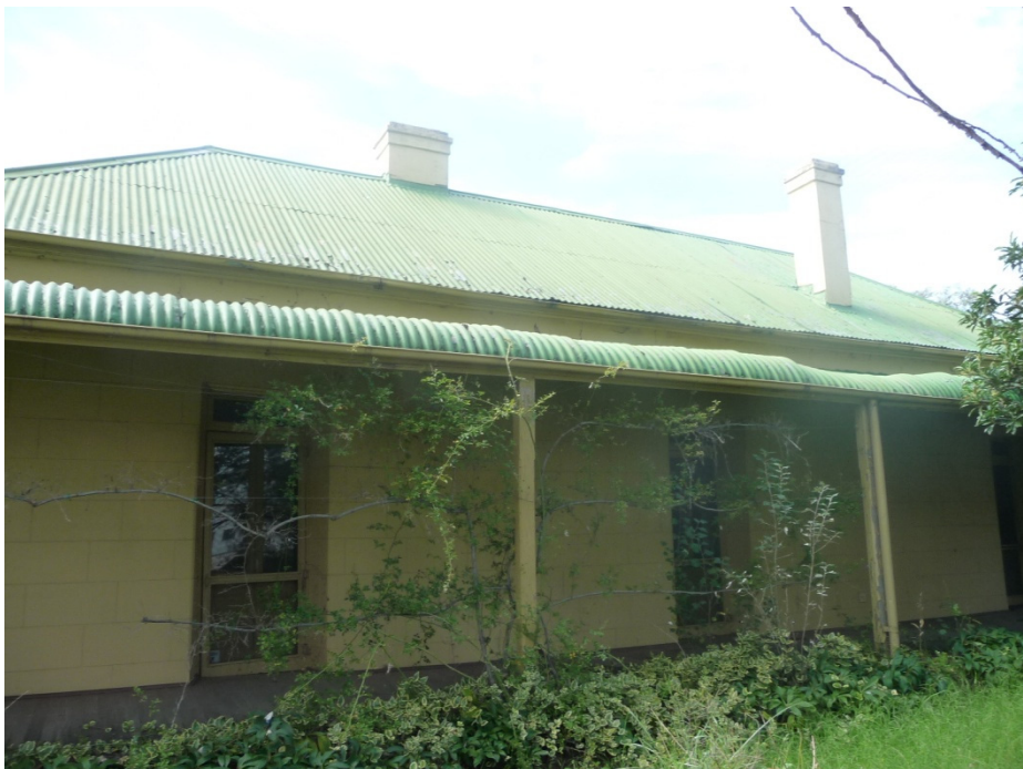
Fig 3: Pisé homestead with bull-nosed verandah, c 1909