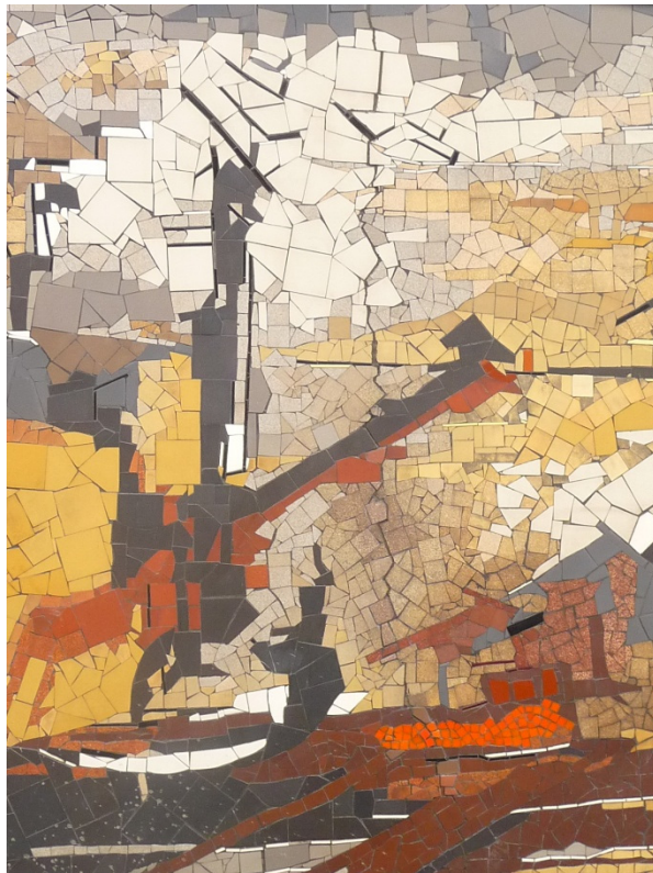
Figure 5. Repaired structural crack of sections 11 and 12 (ACT Heritage Unit, Sep 2012).