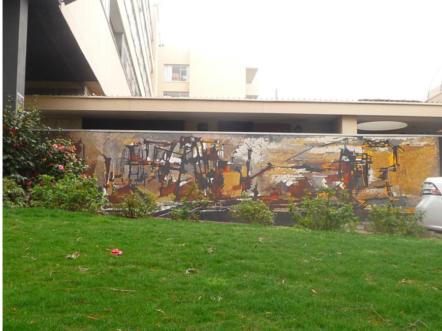
Figure 2. 'Expansion' Mosaic Mural Wall as seen from Northbourne Avenue (ACT Heritage Unit, Sep 2012).