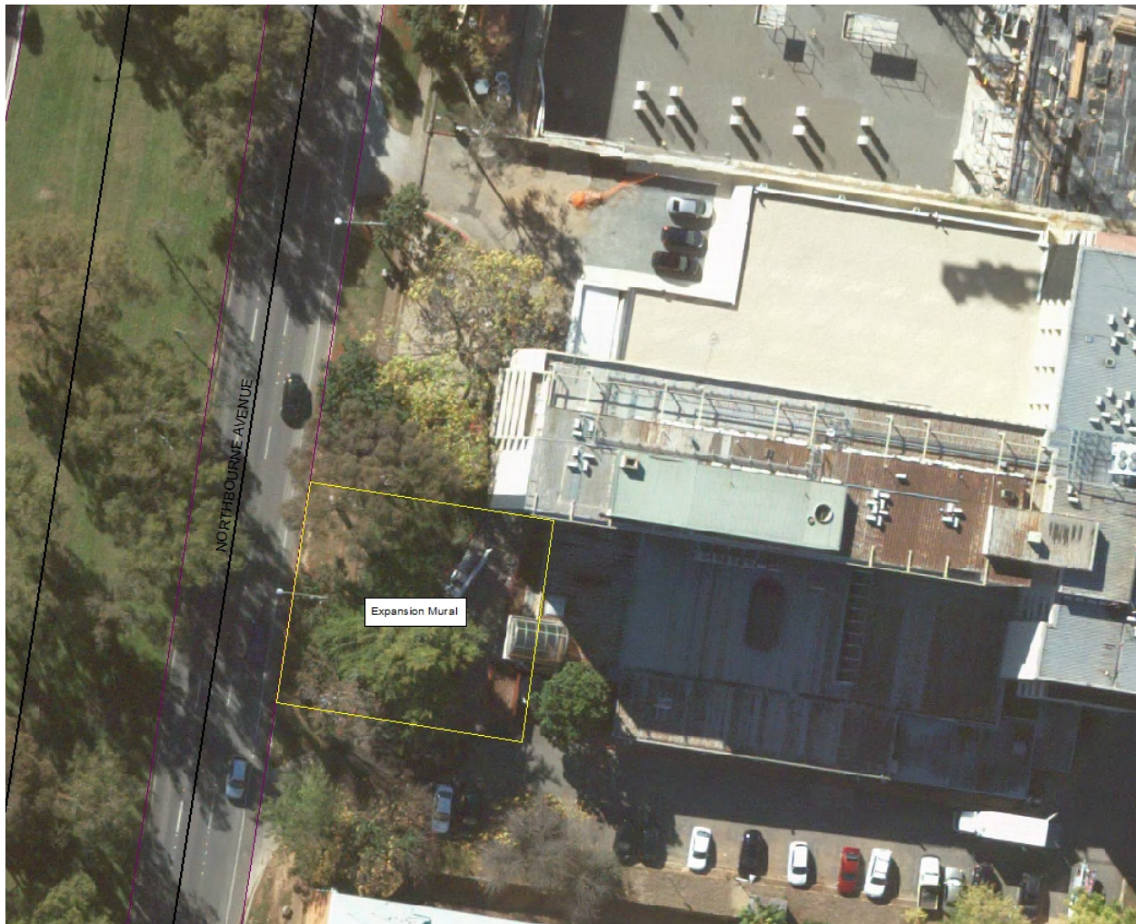
Figure 1. Location of the Mural and open character landscape area between the Mural and Northbourne Avenue, at the Rex Hotel, Northbourne Avenue. Boundary is indicated by yellow line. Map is not to scale.