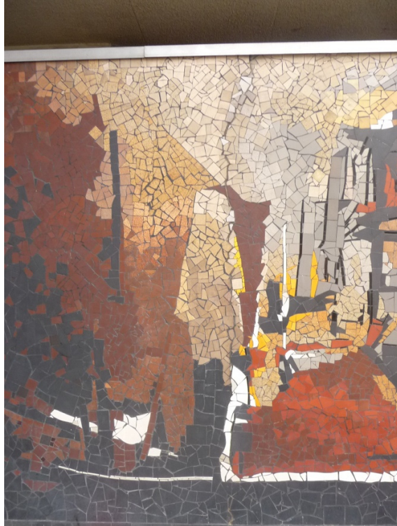
Figure 4. Repaired Structural Crack 1, situated in sections 5 and 6 (ACT Heritage Unit, Sep 2012).