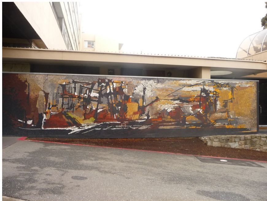
Figure 3. 'Expansion' Mosaic Mural Wall as seen from the driveway of the Rex Hotel (ACT Heritage Unit, Sep 2012).