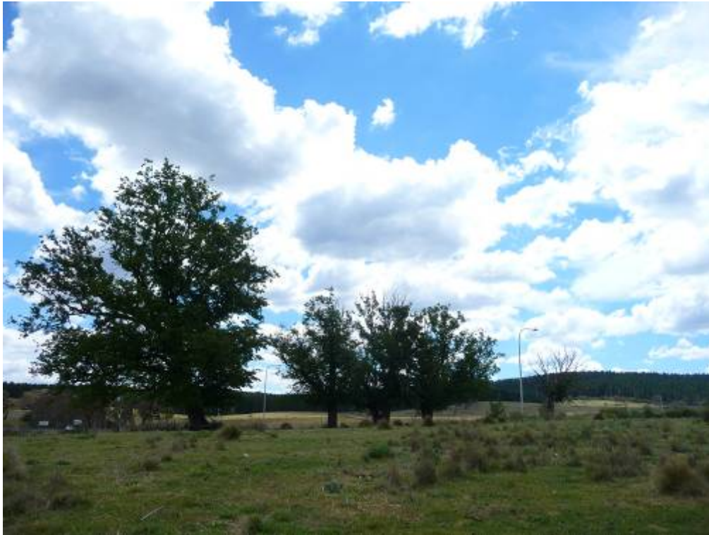
Image 2: Dutch elms that form the western border for the Hibernian Hotel Site. (ACT Heritage, 2013)