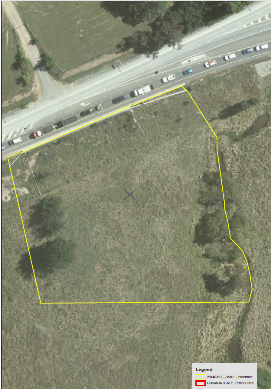
Image 1 Hibernian Hotel Site boundary.