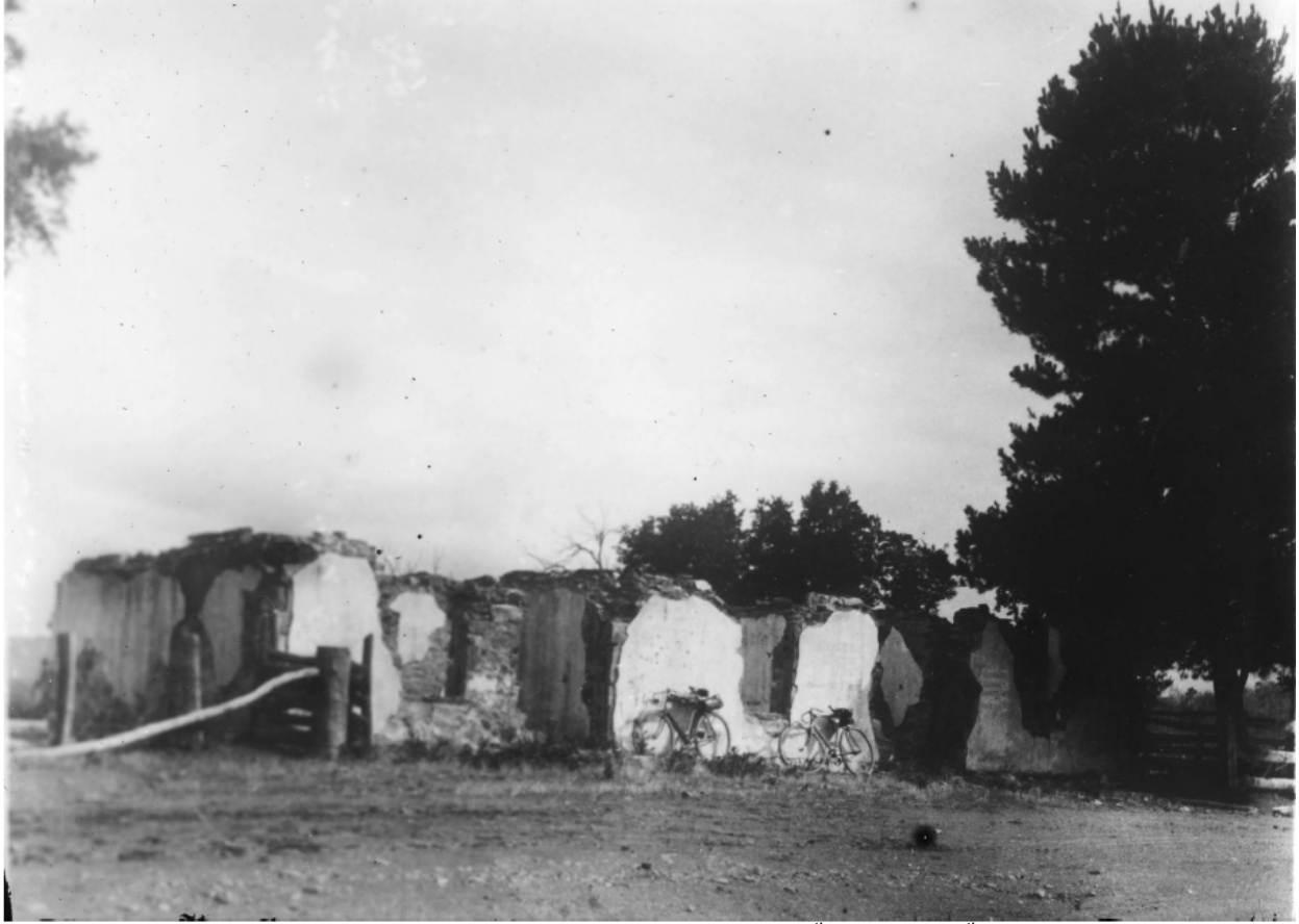
Image 4 The standing ruins of the Hibernian Hotel from the late 19 th or early 20 th century (from Williams, 2008)