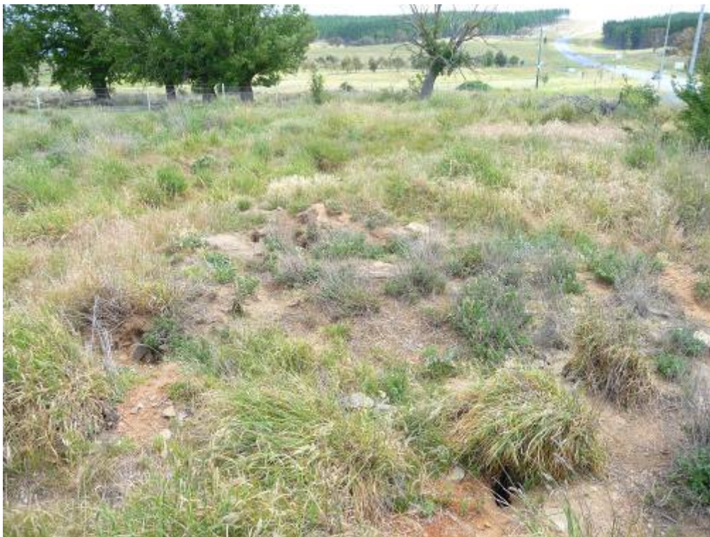
Image 3: Footings of the Hibernian barely visible under soil and vegetation. Evidence of rabbit burrow disturbance in the foreground. The row of Dutch Elms in the background. The Kings Highway in the background to the right. (ACT Heritage, 2013)