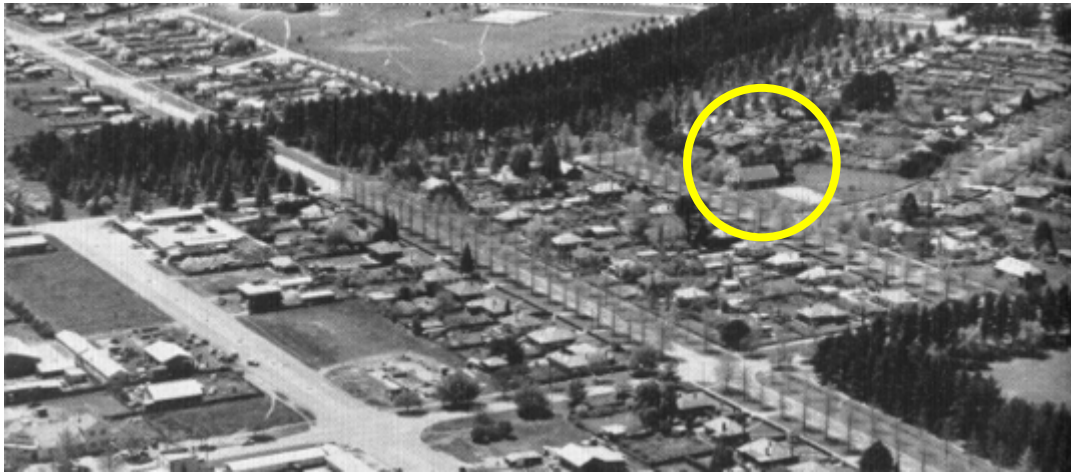
Image 3. Aerial photograph of Braddon c.1950, with Shakespeare Hall (formerly St Columba's Presbyterian Church Hall) circled. The tennis court can be seen to the right of the Hall. ( http://commons.wikimedia.org/wiki/File:Braddon_1950.png )