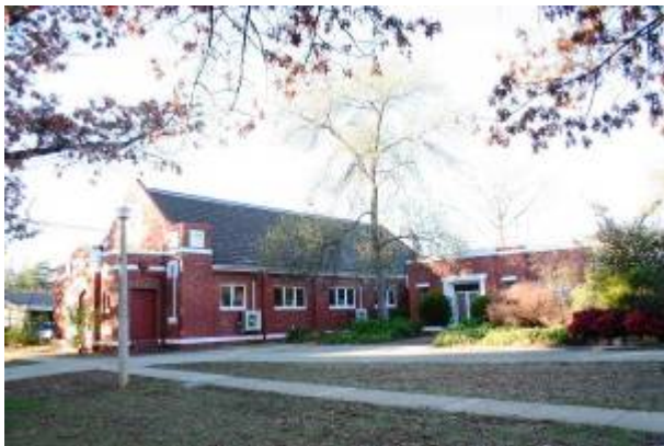
Image 7. Shakespeare Hall (formerly St Columba's Presbyterian Church Hall) south facade with 1957 additions shown to the right.