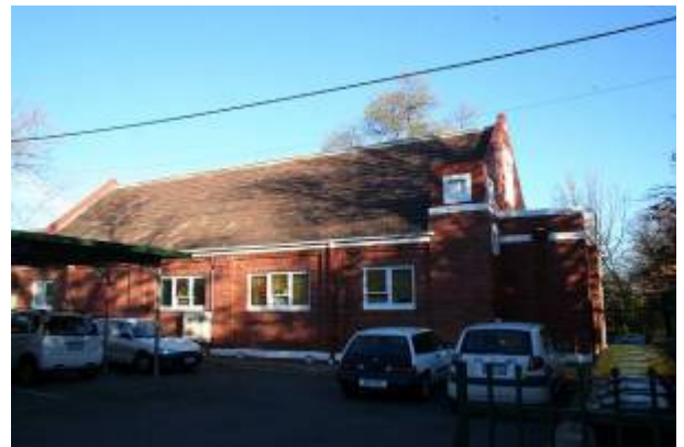
Image 8. Shakespeare Hall (formerly St Columba's Presbyterian Church Hall) north facade and carpark.