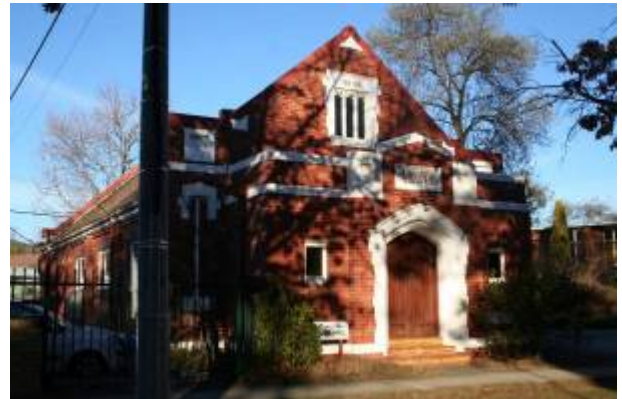
Image 6. Shakespeare Hall (formerly St Columba's Presbyterian Church Hall) west facade/front.