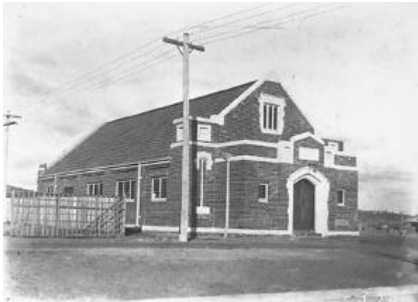
Image 5. W J Mildenhall photo National Archives of Australia, A3560, 3391.