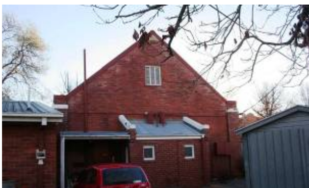
Image 9. Shakespeare Hall (formerly St Columba's Presbyterian Church Hall) east facade/rear.