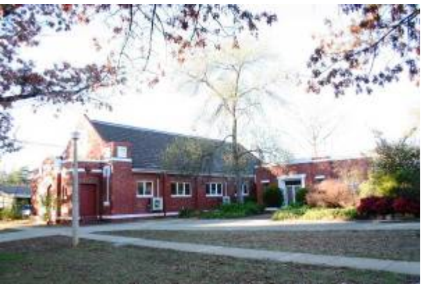
Image 7. Shakespeare Hall (formerly St Columba's Presbyterian Church Hall) south facade with 1957 additions shown to the right.