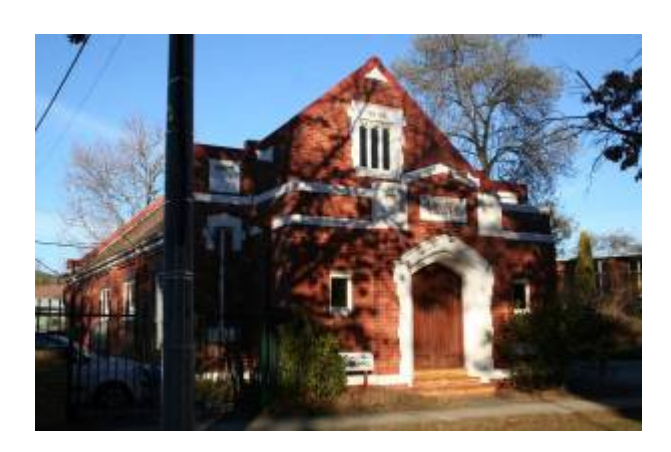
Image 6 . Shakespeare Hall (formerly St Columba's Presbyterian Church Hall) west facade/front.