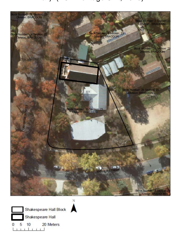
Image 2 . Positioning of Shakespeare Hall (formerly St Columba's Presbyterian Church Hall) within block 30 section 23, Braddon. (ACT Heritage Unit, 2013)