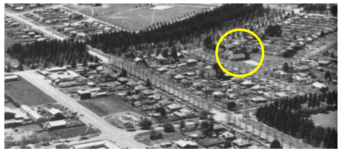
Image 3. Aerial photograph of Braddon c.1950, with Shakespeare Hall (formerly St Columba's Presbyterian Church Hall) circled. The tennis court can be seen to the right of the Hall. (http://commons.wikimedia.org/wiki/File:Braddon_1950.png)