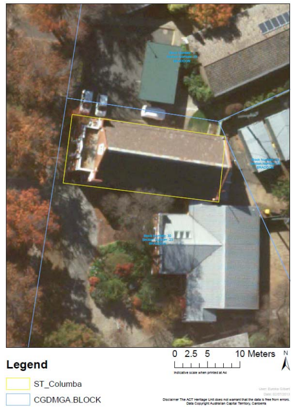
Image 1 . Registration Boundary of Shakespeare Hall (formerly St Columba's Presbyterian Church Hall). (ACT Heritage Unit, 2013)