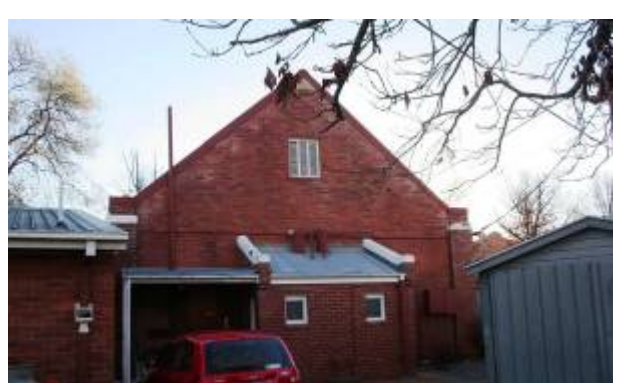
Image 9. Shakespeare Hall (formerly St Columba's Presbyterian Church Hall) east facade/rear.