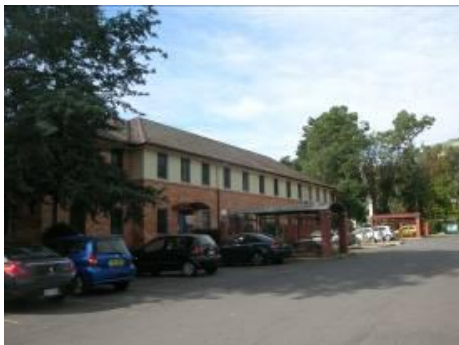
Image 11 South elevation 22 April 2014