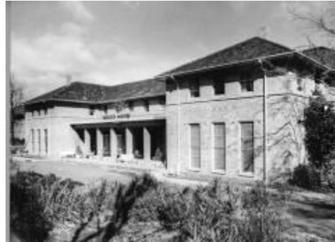
Image 5 Havelock House main entrance, 10 September 1971