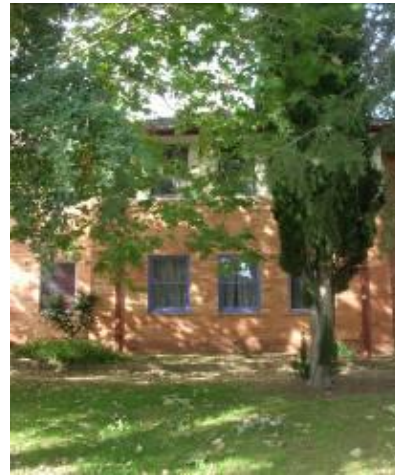
Image 13 Detail of west elevation – south end 22 April 2014