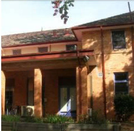
Image 10 Detail of brickwork to north verandah 22 April 2014