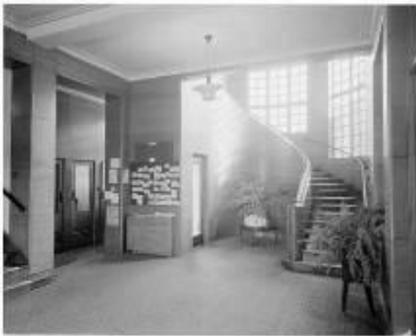
Image 3 Foyer of Havelock House, 1959 showing the curved stair and timber veneer panelling.