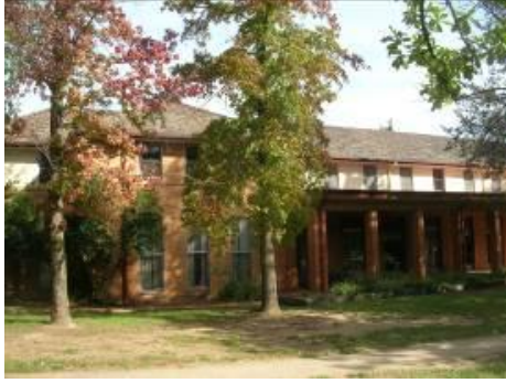
Image 9 View from northwest showing the verandah off the original dining room. 22 April 2014