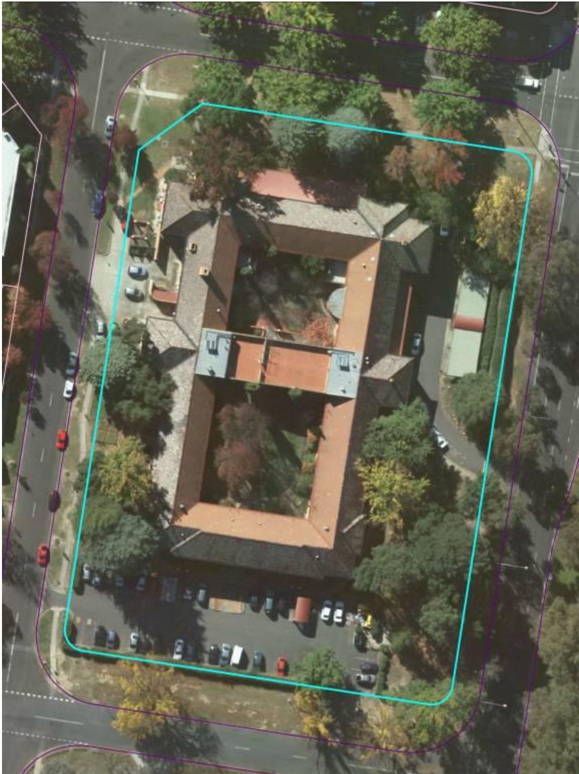
Image 1 Registration Boundary, Havelock House, Turner