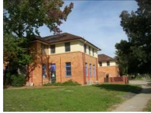
Image 12 View from northwest. The taller windows at the ground floor reflect the use of this end of the building for community spaces. 22 April 2014