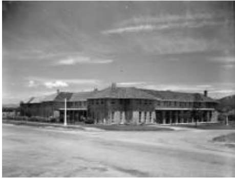
Image 2 Havelock House, December 1952