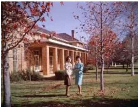
Image 4 Havelock House 1963