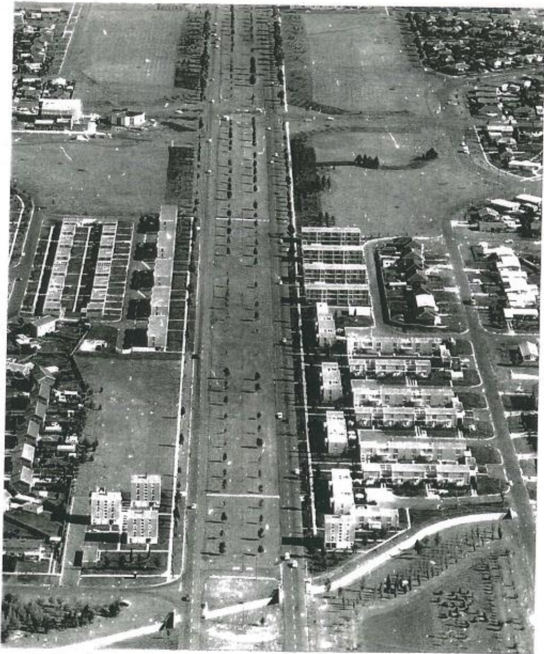
Image 12 Northbourne Housing Precinct Aerial Imagery, 1964 (Irving, 1999:4)