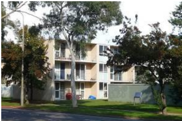
Image 3 Three storey flats (Owen Flats), Lyneham (ACT Heritage 2014)