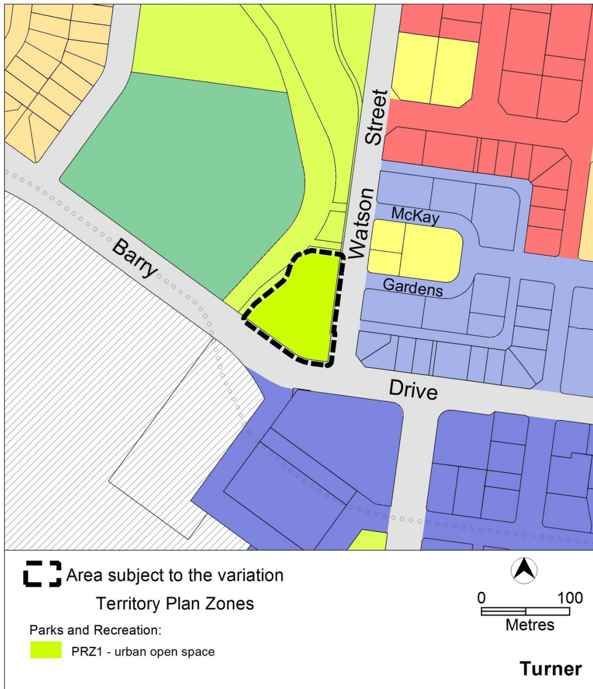
Figure 2: Current Territory Plan Zones map

The Territory Plan map zones for the area subject to this variation are shown in Figure 2. The subject site is zoned PRZ1 Urban Open Space Zone and is reserved public land, having a Pe – Urban Open Space Overlay. The development table for this zone currently lists 'Public transport facility' as a prohibited land use.