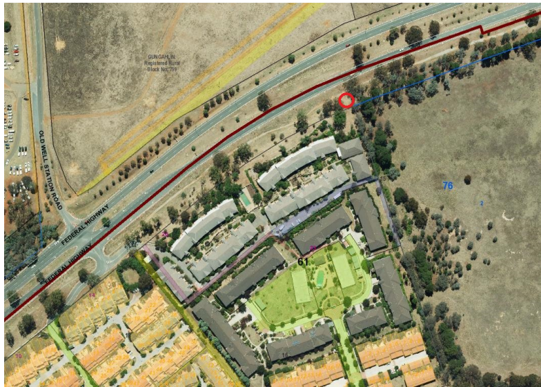
Sign location indicated by red circle.

The Starlight Drive-in Theatre Sign is located adjacent to the Federal Highway, on road reserve. It is situated within approximately 10 metres of its original location which marked the entrance to the Drive-in.