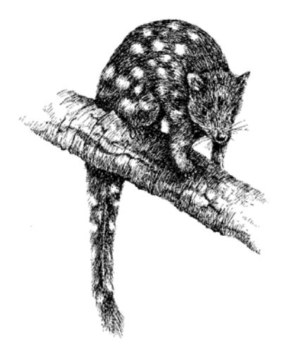
Figure 1. Spotted-tailed quoll (Dasyurus maculatus)

Dasyurus maculatus is a marsupial carnivore endemic to eastern Australia. Male D. maculatus have a head and body length of 380–760 mm, a tail length of 370–550 mm and weigh up to 7 kg (average 3 kg). Females have a head and body length of 350–450 mm, a tail length of 340–420 mm and weigh up to 4 kg (average 2 kg). The fur ranges from rich rufous brown to dark above while pale below. The large size and conspicuous white spots of varying size over the body and tail distinguish it from other quoll species (Edgar and Belcher 1995) (Figure 1).