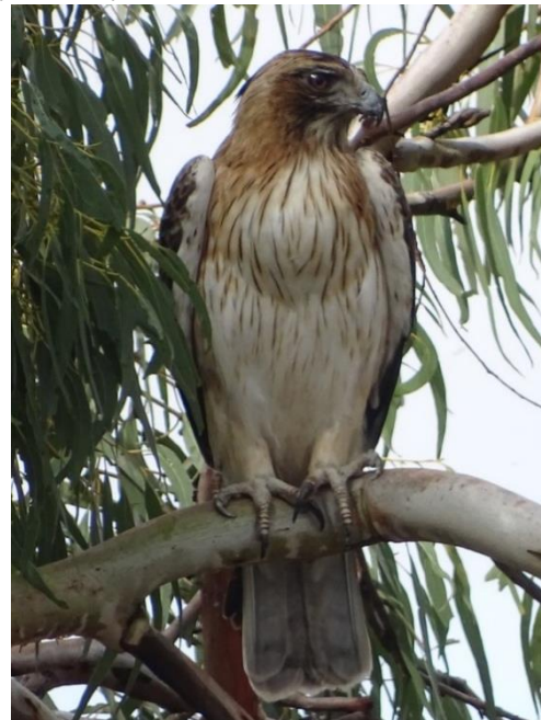
Little Eagle (Roy McDowall – Canberra Nature Map)

The Little Eagle is a fast, agile hunter and takes live prey by swooping from either elevated perches or while soaring up to 500 m altitude (Marchant and Higgins 1993; Olsen et al. 2006; Debus et al. 2007; Debus and Ley 2009). Diet is broad and varies based primarily on availability, however rabbits (mostly juveniles), birds (parrots and small passerines <500 g), insects and reptiles are typical dietary inclusions (Baker-Gabb 1984; Marchant and Higgins 1993; Debus 1998; Debus and Rose 1999; Olsen and Osgood 2006; Olsen et al. 2006; Debus et al. 2007; Debus and Ley, 2009; Olsen et al. 2010). Carrion is also occasionally taken. In the ACT region its diet comprises mostly rabbits and to a lesser extent birds (especially rosellas, Magpie-larks and Starlings) (Olsen & Fuentes, 2004; Olsen et al. 2006; Olsen et al. 2010; Rae et al. 2018).