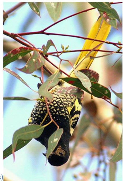
Adult Regent Honeyeater

The Regent Honeyeater is a striking, medium-sized honeyeater measuring 20–23 cm in length and weighing 31–50 g. It has predominantly black plumage and its tail and wing feathers are edged with bright yellow. Its body feathers are broadly edged in pale yellow, except for the head and neck. A large patch of yellow-pink, bare, warty skin surrounds each eye. The overall visual impression is a blackish bird boldly embroidered with yellow and with brilliant yellow flashes in the wings and tail (Pizzey 1981, Menkhorst 1993). Females are smaller and duller than males while juveniles are browner (Birdlife International 2018).