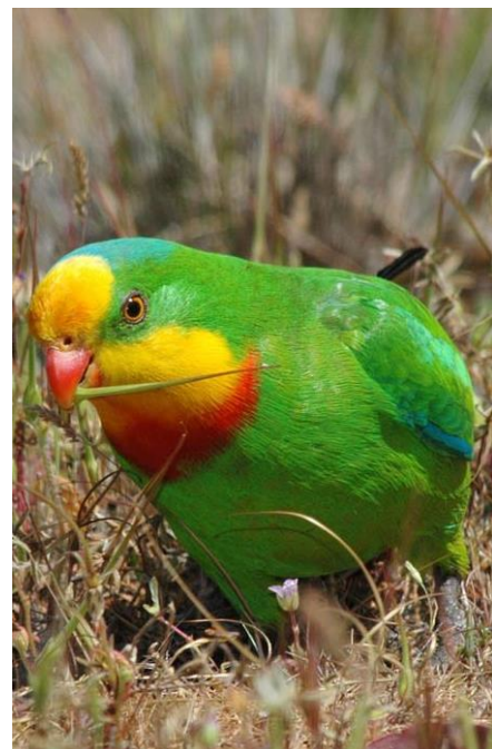
Adult Male Superb Parrot (Stuart Harris – Canberra Birds)

Superb Parrots are usually seen in pairs or in flocks of up to 30 birds in the non-breeding season. Females leave the flocks to begin nesting, which occurs between September and December (Forshaw and Cooper 1981).