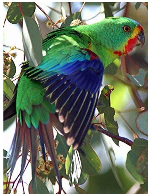
Swift Parrot (Geoffrey Dabb – Canberra Birds)

The Swift Parrot is a slim, medium-sized, nectar-eating parrot with angular pointed wings and a slender tail giving it a characteristic streamlined flight-silhouette (Higgins 1999). It is mostly bright green in colour, with dark-blue patches on the crown, a prominent red face, and chin and throat narrowly bordered with yellow. It is approximately 25 cm in length, its wingspan is 32–36 cm and it weighs approximately 65 g.