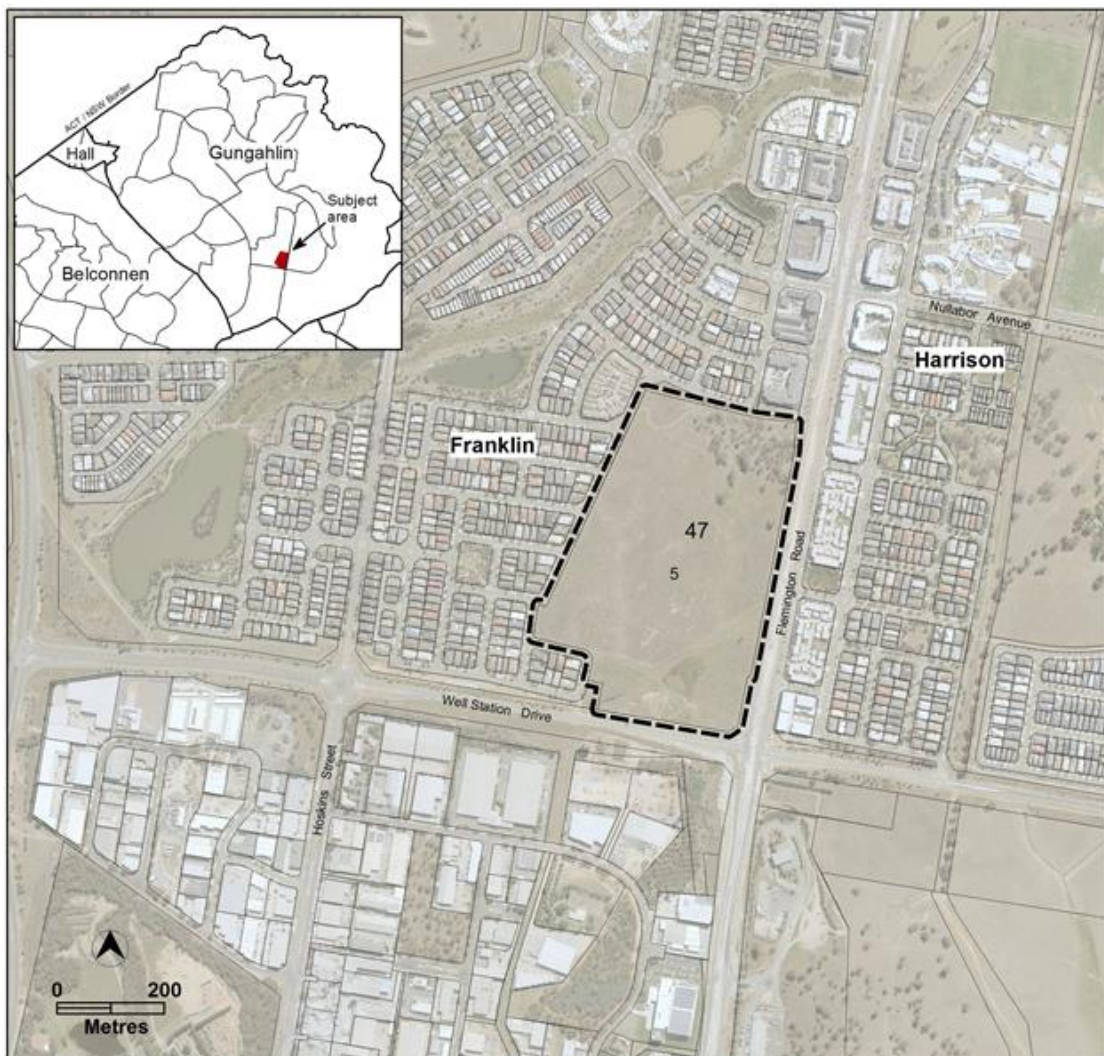
Figure 1 Location plan

The EPBC decision requires the offset site to be legally protected and to remain an environmental conservation offset in perpetuity. This is achieved by classifying the site as a nature reserve and identifying on the Territory Plan Map as 'Pc – a nature reserve' Public Land Reserve overlay. There is no change to the current non-urban NUZ3 Hills Ridges and Buffer zone.